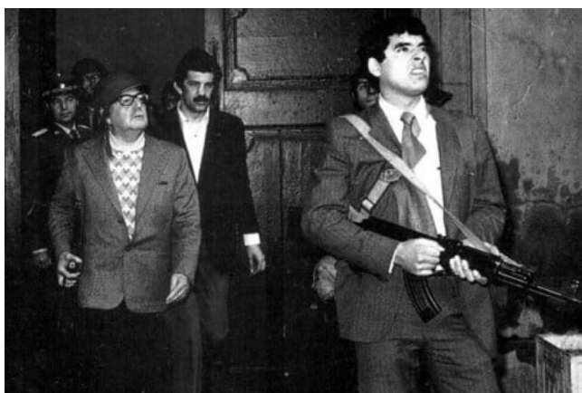
Salvador Allende in the defense of the Palacio de la Moneda, September 11, 1973 (left)

At the time of the September 11, 1973 military coup, I was Visiting Professor of Economics at the Catholic University of Chile. In the hours following the bombing of the Presidential Palace of La Moneda, the new military rulers imposed a 72-hour curfew.