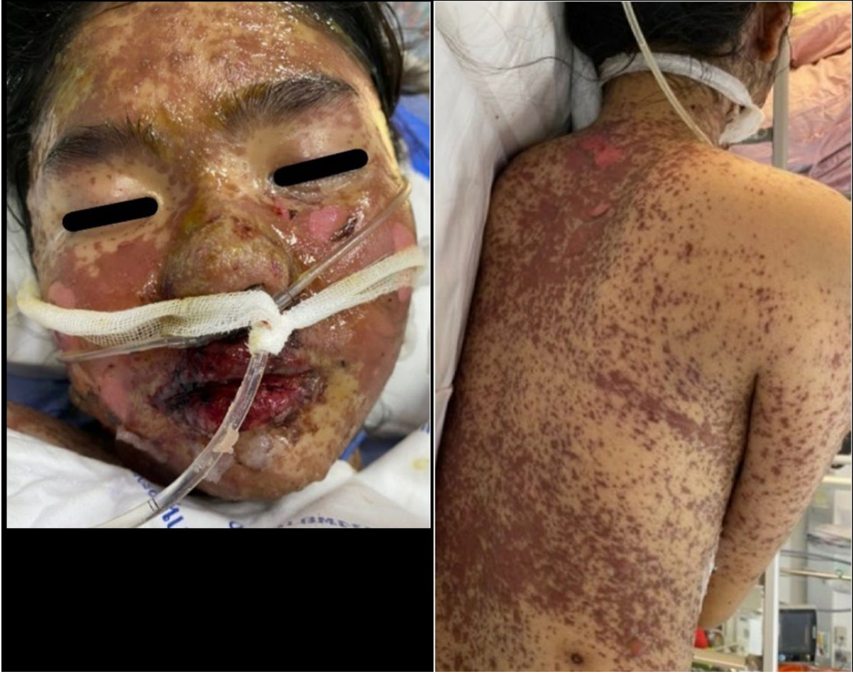
San Diego, CA - 12 year old boy developed "Eosinophilic cellulitis" one day after 2nd dose of Pfizer COVID-19 mRNA jab, Jan. 2022 ( click here )