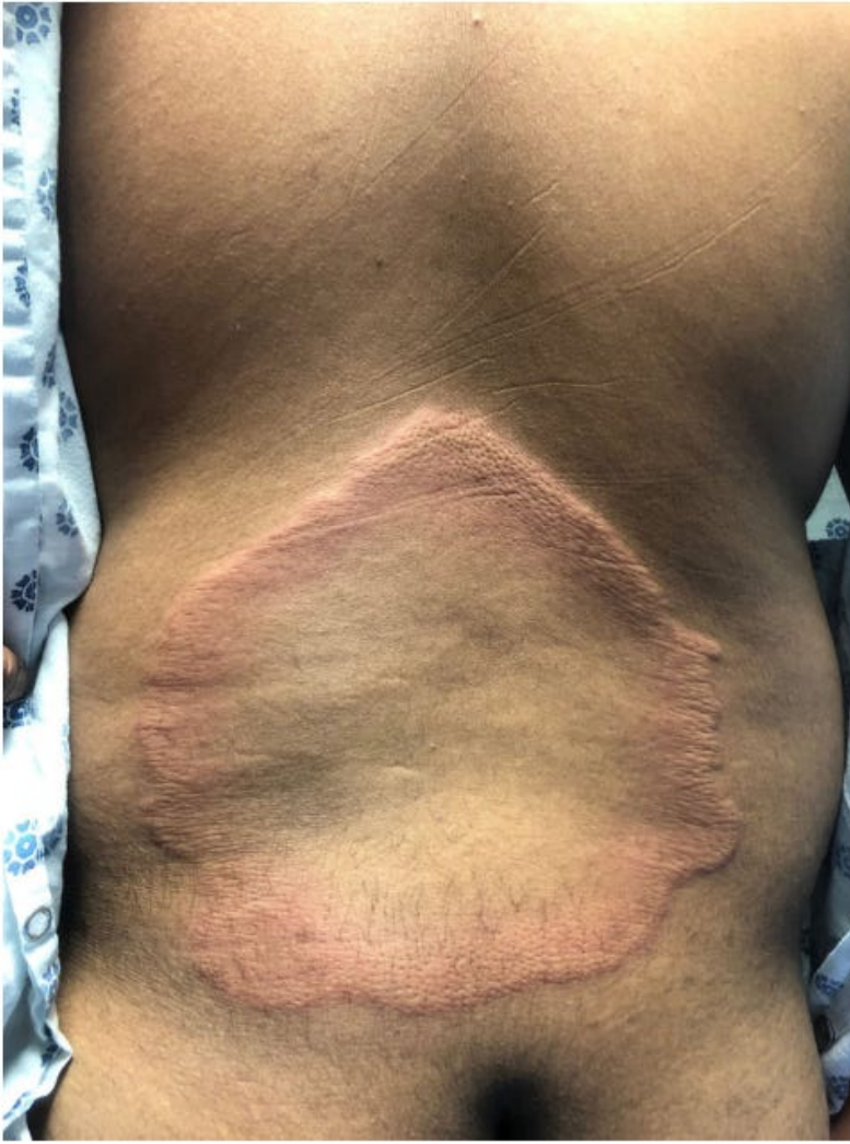
FIGURE 1 Large annular pink indurated plaque with a peau d'orange appearance on lower back

Florida - 10 year old girl developed Acute disseminated encephalomyelitis with autoimmune brain lesions after 2nd Pfizer COVID-19 mRNA jab, July 2022 ( click here )