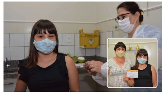
A 10-year-old girl from São Paulo, Brazil has suffered a cardiac arrest and was in critical condition 12 hours after taking a dose of the Pfizer vaccine, the Covid World reported.