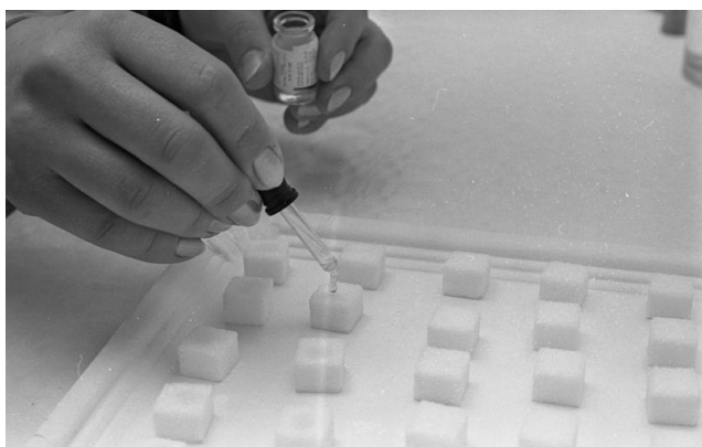
Image: Doses of oral polio vaccine are added to sugar cubes for use in a 1967 vaccination campaign in Bonn, West Germany (Licensed under CC BY-SA 3.0 de)

The next significant stride in vaccine recommendations and requirements for children would arrive a century later—in 1954, to be exact, when attention was focused on the polio vaccine developed by Jonas Salk .