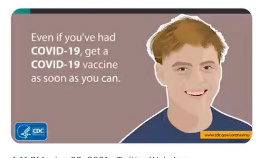
4:11 PM · Jun 25, 2021 · Twitter Web App

True! Experts do not yet know how long you are protected from getting sick again after recovering from #COVID19. Get your COVID-19 vaccine as soon as you can. Learn more: bit.ly/2IWccCd.