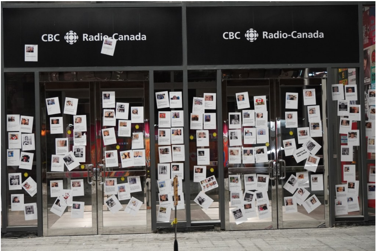
CBC building front doors.