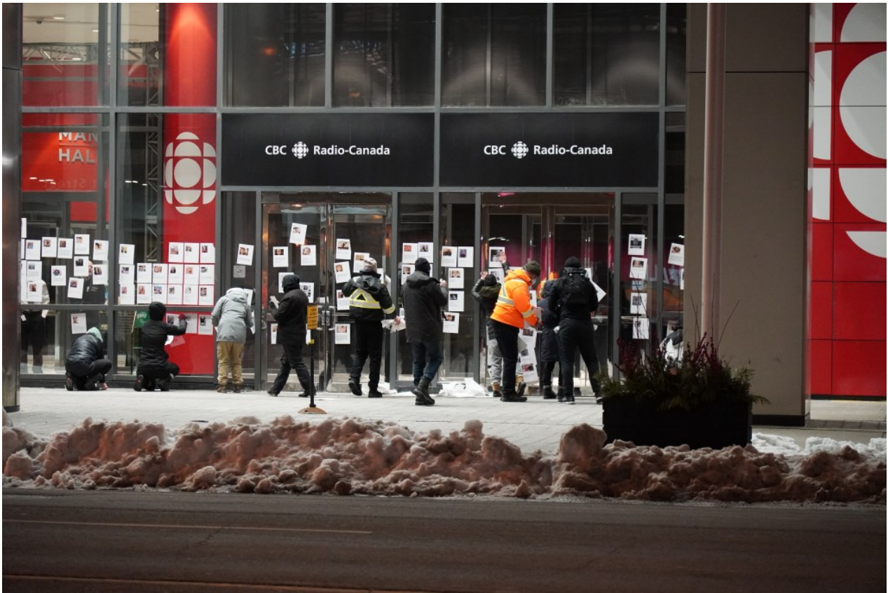
Activists paste hundreds of suspected Covid-19 “vaccine” injuries and death profiles.