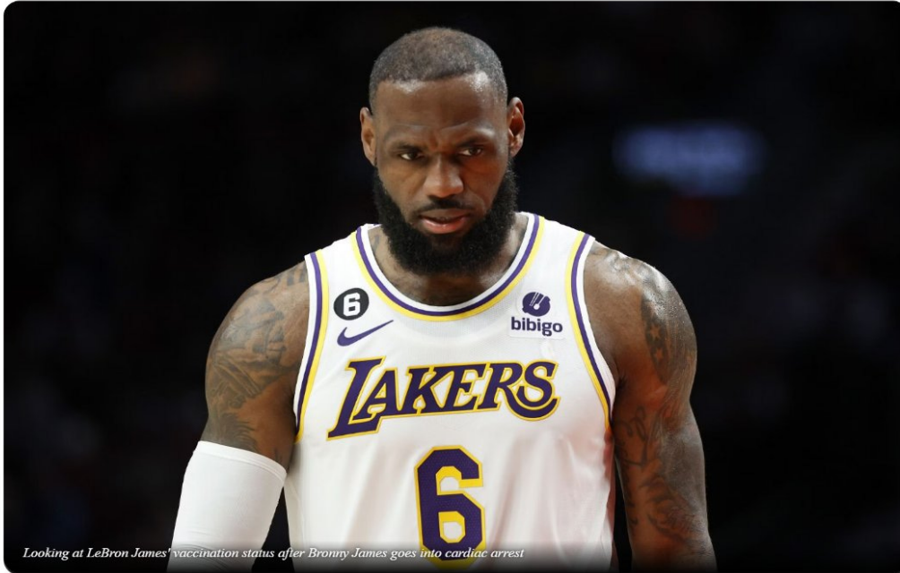
Looking at LeBron James' vaccination status after Bronny James goes into cardiac arrest

“I think everyone has their own choice to do what they feel is right for themselves and their family,” said LeBron. “I know that I was very skeptical about it all, but after doing my research and things of that nature, I felt like it was best suited for not only me but for my family and my friends, and that’s why I decided to do it.”