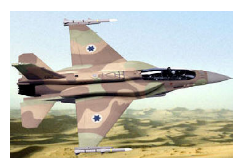
Table 2b: F-16 "Fighting Falcon"

to the USA for the F-15 "Eagle" Tactical Fighter/Bomber (a major Weapons System used by Israel)