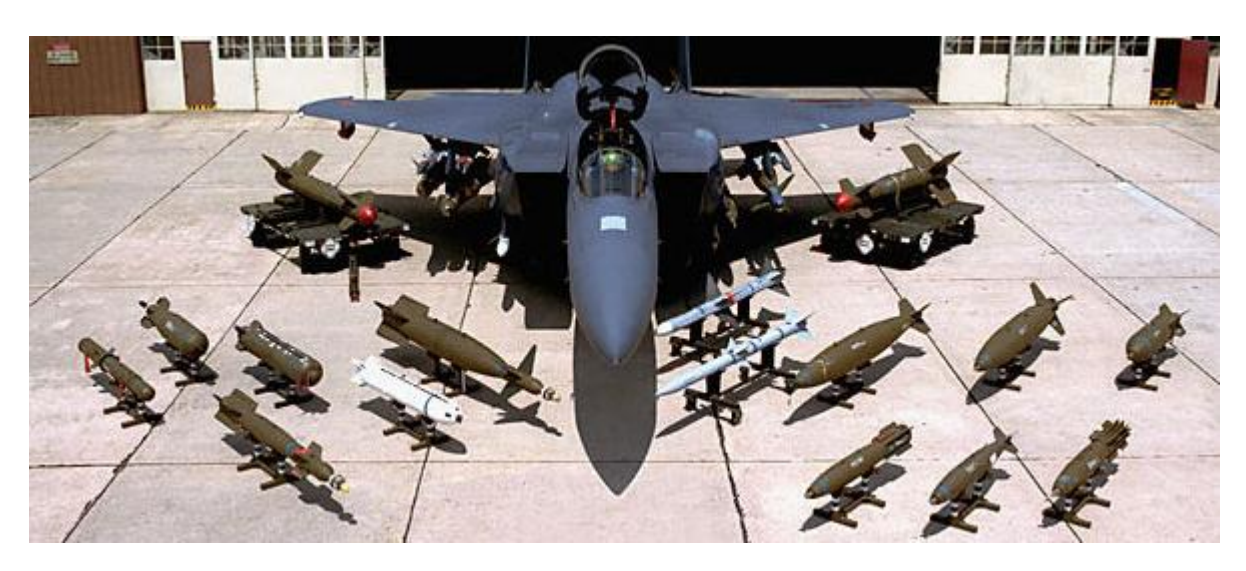
Table 2a: F-15 "Eagle"

COAT's report lists more than 50 Canadian military exporters that have supplied a wide range of essential components and/or services for three major US weapons systems that are used by the Israeli Air Force: the F-15, F-16 and AH-64. These fighter/bomber aircraft and helicopter attack gunships were the main varieties of weapons systems employed by Israel during the recent aerial bombardments of Gaza. In an effort to document Canadian contracts that have supplied these US weapons systems, COAT's report provides hundreds of links to corporate and government sources: