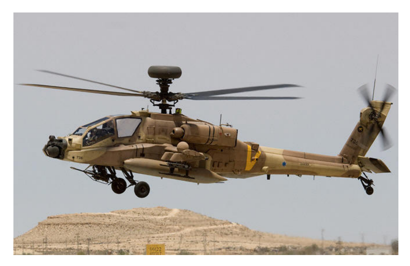
Table 2c: AH-64 "Apache"

This table compiles data on 18 Canadian military exporters and provides internet links to about 100 sources detailing their complicity in the production of the AH-64 weapons system. Over 60% of these companies are now members of CADSI, while 17% are former members. More than two thirds of these military companies exhibited their products at the CANSEC arms show in 2008.