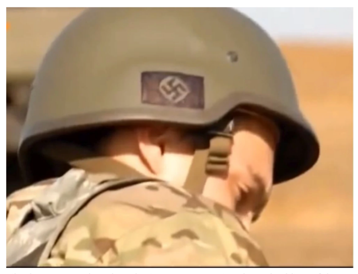
File photo: A news broadcast by German ZDF station showed soldiers of the Ukraine Azov Battalion with nazi symbols on their helmets.

David Pugliese • Ottawa Citizen Nov 08, 2021 • November 9, 2021 • 4 minute read