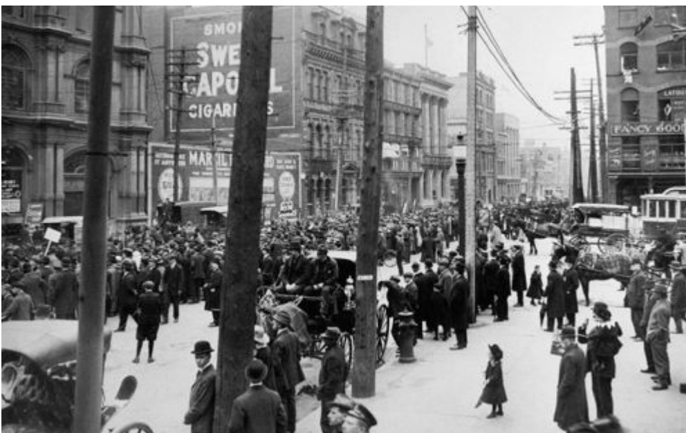
Montreal rally in Victoria Square on May 17, 1917 was one of many opposing conscription during WWI.

Robert Laird Borden, then Conservative Prime Minister of Canada, was eager to participate in the war. By Sunday, August 9, 1914, the basic orders-in-council had been proclaimed, and a war session of parliament opened just two weeks after the conflict began. Legislation was quickly passed to secure the country's financial institutions and raise tariff duties on some high-demand consumer items. The War Measures Act 1914 , giving the government extraordinary powers of coercion over Canadians, was rushed through three readings.[1]