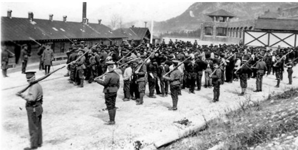
Internment camp in Banff, Alberta.

Upon Great Britain’s declaration of war on Germany, the Borden Conservative government enacted the War Measures Act , in August 1914. The law’s sweeping powers allowed the government to suspend or limit civil liberties and provided it the right to incarcerate “enemy aliens.”