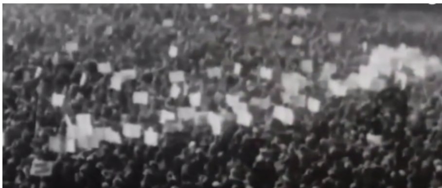
Thousands of demonstrators march to Place Montcalm on March 29, 1918.

On the evening of March 28, 1918, federal police raided a bowling alley and arrested the youth there. Faced with the arbitrariness and violence of the police, 3,000 people besieged the police station and continued their demonstration in the streets during the night.