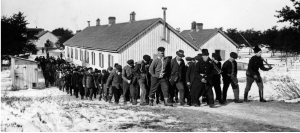
Internment camp in Petawawa, Ontario.