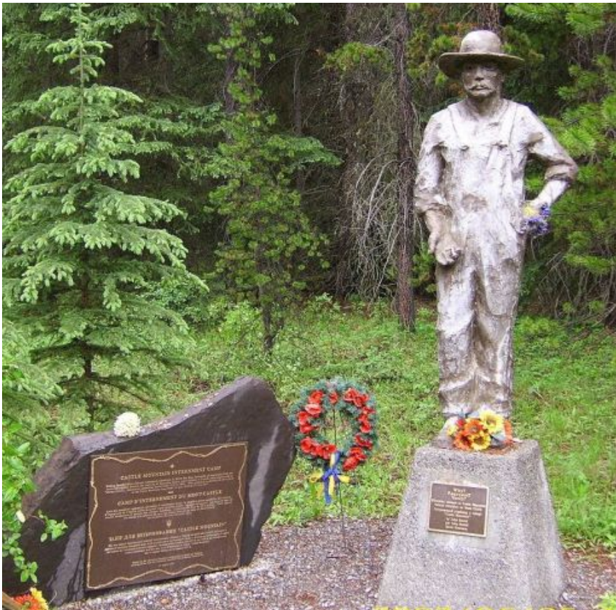
Monument to those interned at the Castle Mountain camp in Alberta.

The internment camps were often located in remote rural areas, including in Banff, Jasper, Mount Revelstoke and Yoho national parks in Western Canada. Internees had much of their wealth confiscated. Many of them were used as forced labour on large projects, including the development of Banff National Park and numerous mining and logging operations. They constructed roads, cleared land and built bridges.