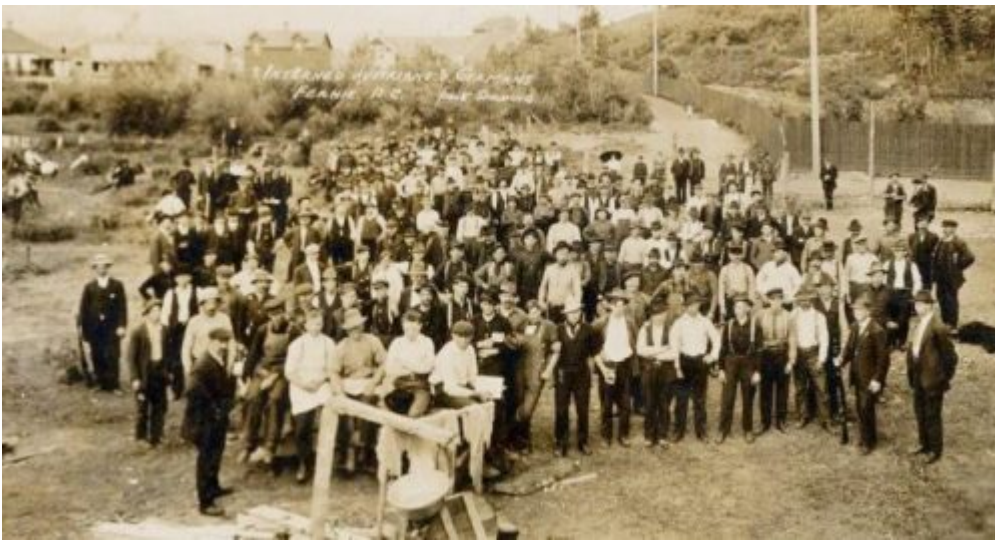
Internment camp in Fernie, BC.

Most internees were young unemployed single men apprehended while trying to cross the border into the U.S. to look for jobs – attempting to leave Canada was illegal. Eighty-one women and 156 children were interned as they had decided to follow their menfolk into the only two camps that accepted families, in Vernon, BC (mainly Germans) and in Spirit Lake near Amos Quebec (mainly Ukrainians).