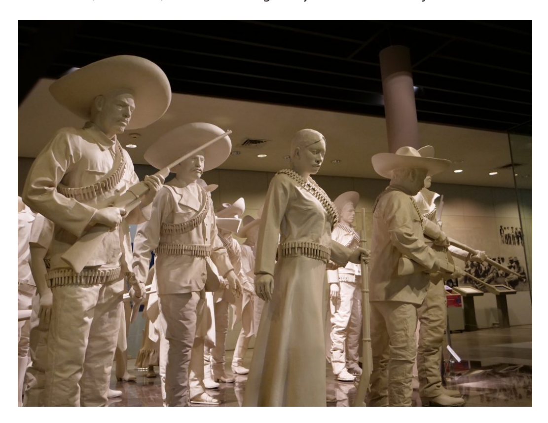
From the revolutionary days

This will be, no doubt, one of the toughest jobs in the country.