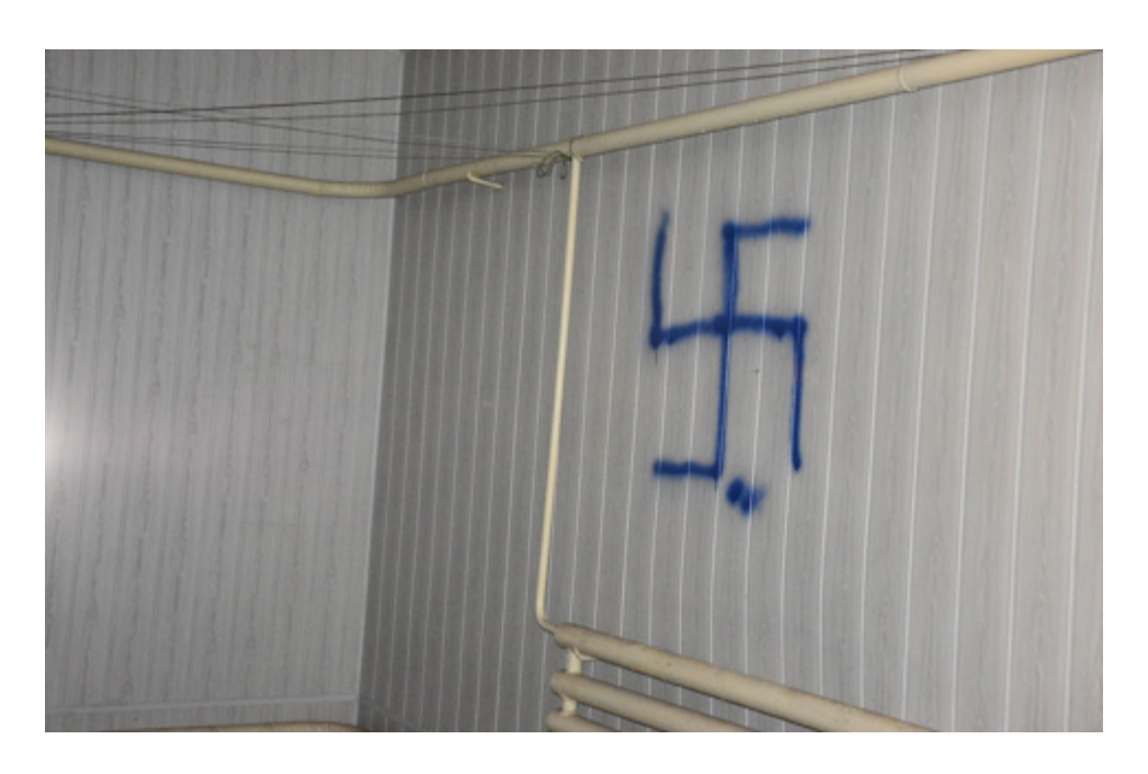
Swastika inside the factory, where Ukrainian Azov were hiding, Illich Steel factory, Mariupol.

The most shocking part of the day though was the visit to one of the former headquarters of the Azov battalion. It wasn't only an office, but it was also a housing and a training facility. Even young children were trained there with guns and rifles.