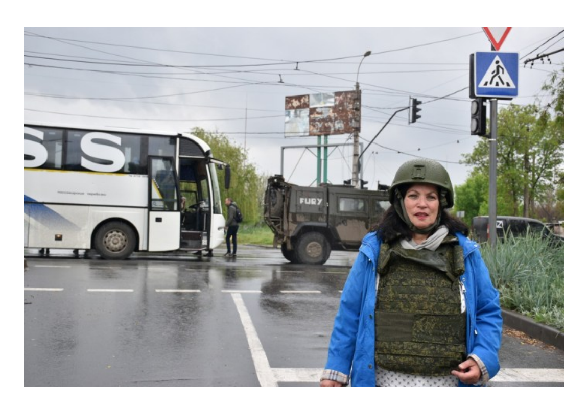
Arriving for the second time in Mariupol, DPR.

Some public facilities in the cities were working again. The city square was cleaned, we even had a quick look in the zoo, where the animals were still alive. The Western media again are giving opposite stories.