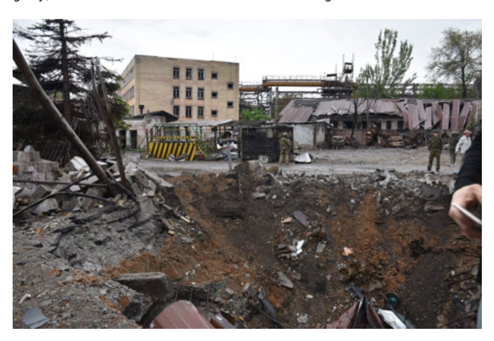
Inside the Illich Steel factory, a huge crater, Mariupol.

In the basements of the Illich factory were symbols of this Nazi ideology, symbols that are banned in the West, but are now ignored by Western governments and even all European Union (EU) heads of government. "SLAVA UKRAINE" which literally means: HEIL (HEIL means glory) UKRAINE." Where have we heard this slogan before?