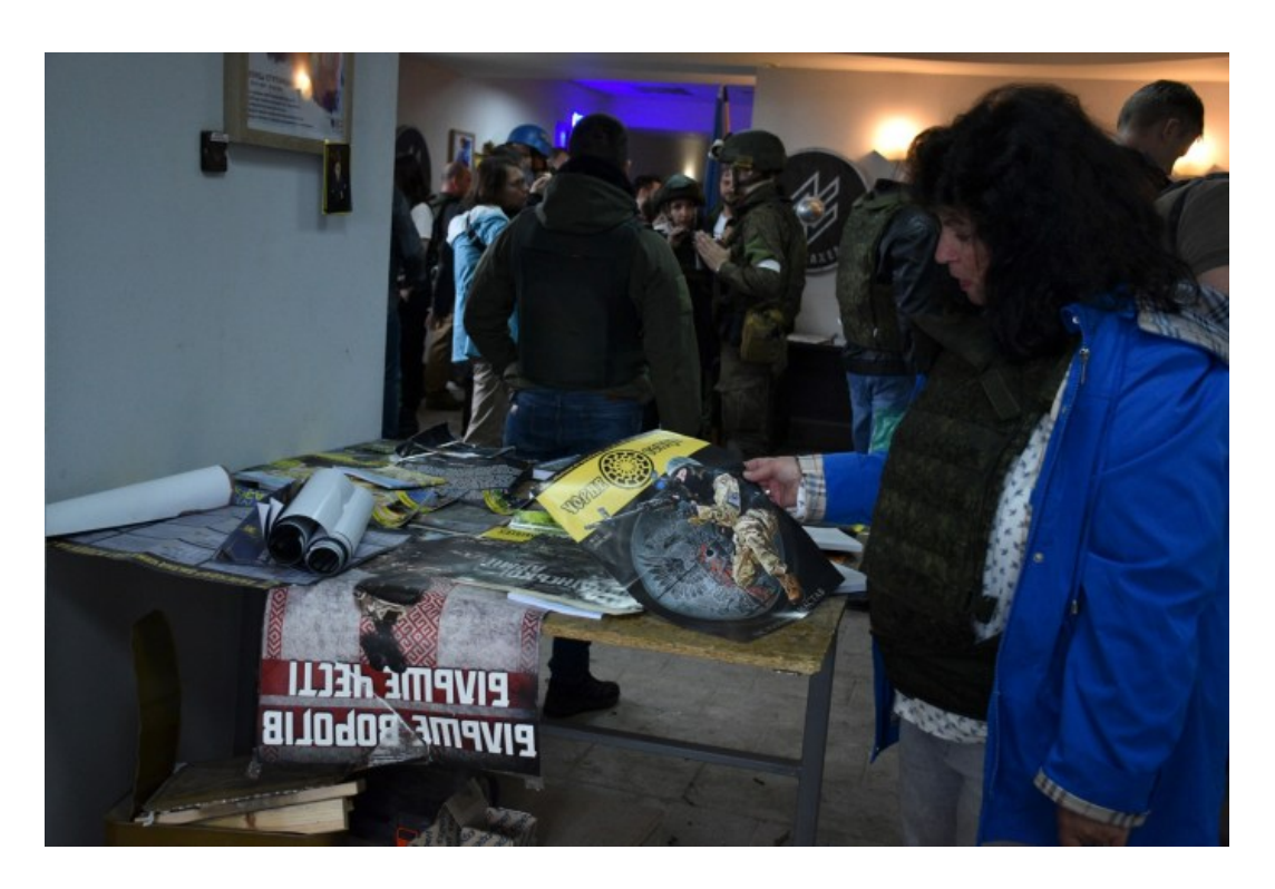
Azov Headquarters in Mariupol.