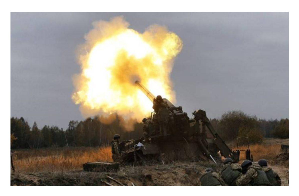
French Caesar guns used to kill civilians in Donbass.

The shells, it was specified, do little material damage when they land on the streets or in the open, but are devastating when they hit a building, having the real capacity by their armorpiercing nature to penetrate structures better, with the devastation one can imagine.