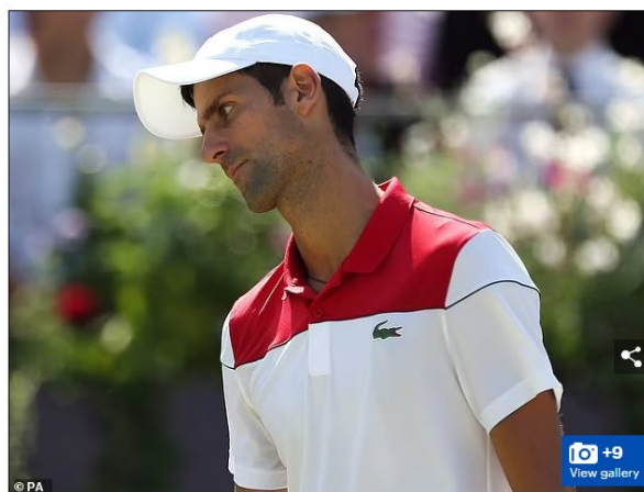
Novak Djokovic's stubbornness has often got him over the line in tight matches on the court

Most tennis players have now accepted, some albeit reluctantly, that they and their sport are best served by taking a vaccine that has saved countless lives.