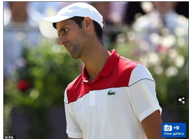
Novak Djokovic's stubbornness has often got him over the line in tight matches on the court

Most tennis players have now accepted, some albeit reluctantly, that they and their sport are best served by taking a vaccine that has saved countless lives.