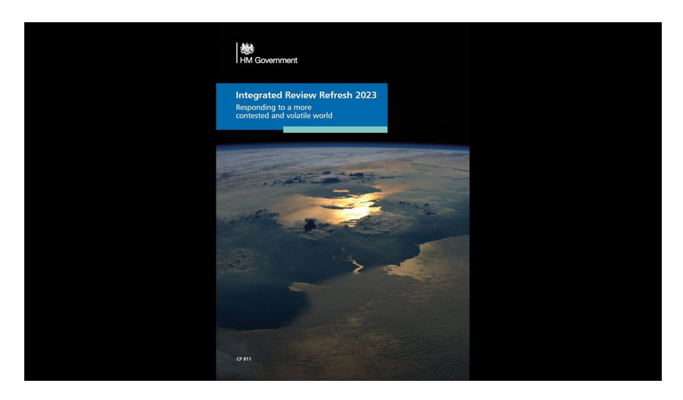
Integrated Review Refresh 2023

Britain supplied £2.3 billion of military assistance to Ukraine in 2022, with a commitment to match that figure in 2023. Thousands of UK troops have been dispatched to Eastern Europe to participate in NATO exercises involving tens of thousands of soldiers and advanced weaponry. UK special forces troops have been deployed to Ukraine, as confirmed in leaked Pentagon files.