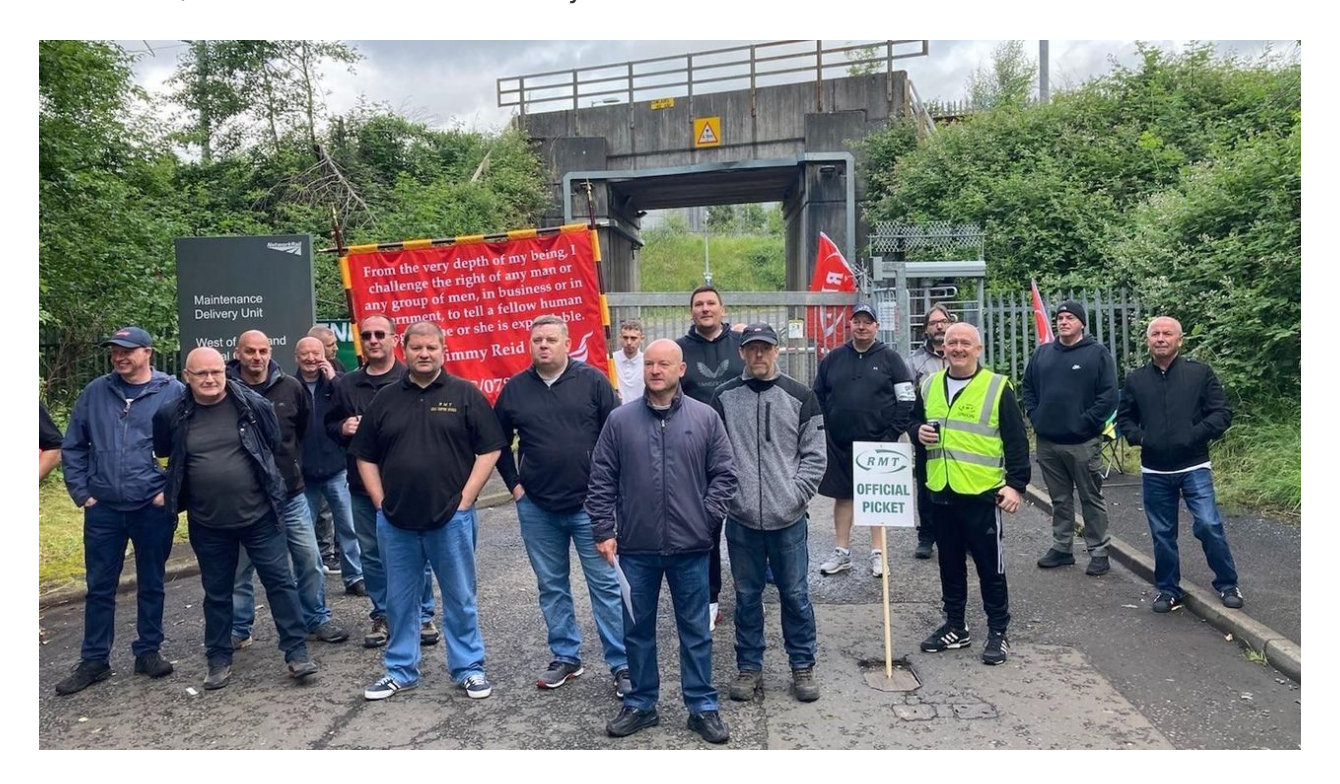
Striking rail workers picketing during the UK wide national rail strike at the Cowlairs maintenance depot in Springburn, north Glasgow, June 25, 2022

ever more naked state repression, exemplified by the new anti-strike Minimum Services Levels Bill, set to become law on May 22.