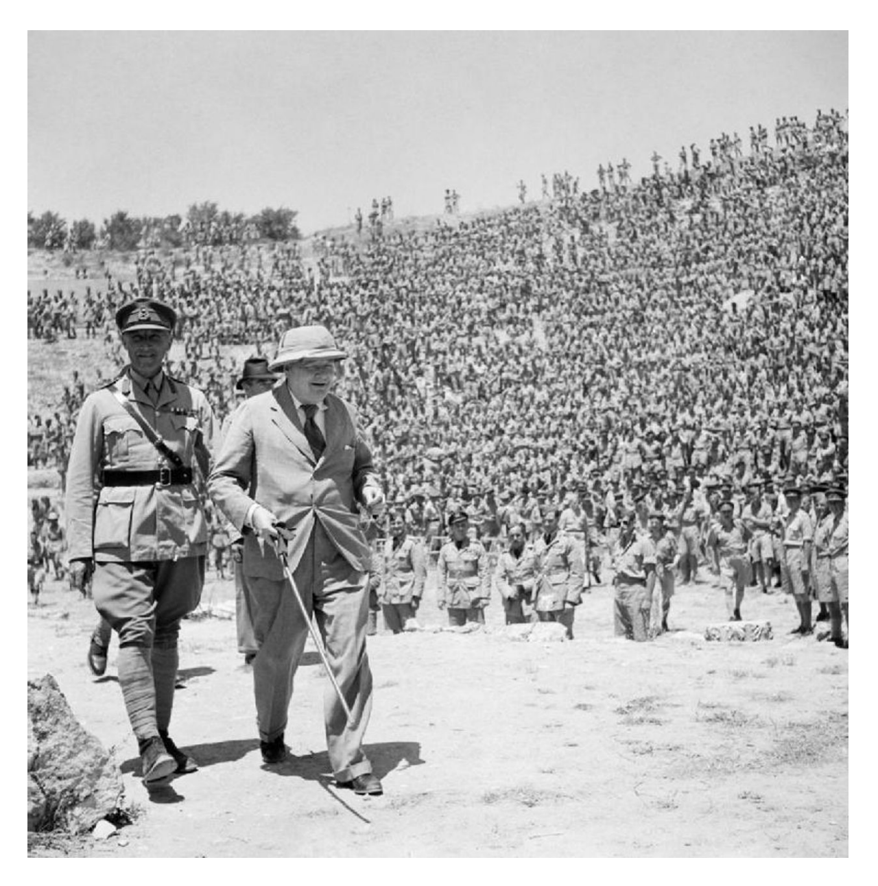
Churchill in the Roman amphitheatre of ancient Carthage to address 3,000 British and American troops, June 1943

While leader of the opposition, Churchill met with former-US army officer Julius Ochs Adler on April 29, 1951, at the height of the Korean War, where he proposed that an ultimatum be delivered to Stalin once he was again prime minister, threatening to "atom bomb one of 20 or 30 cities", to be followed by "if necessary, additional ones."