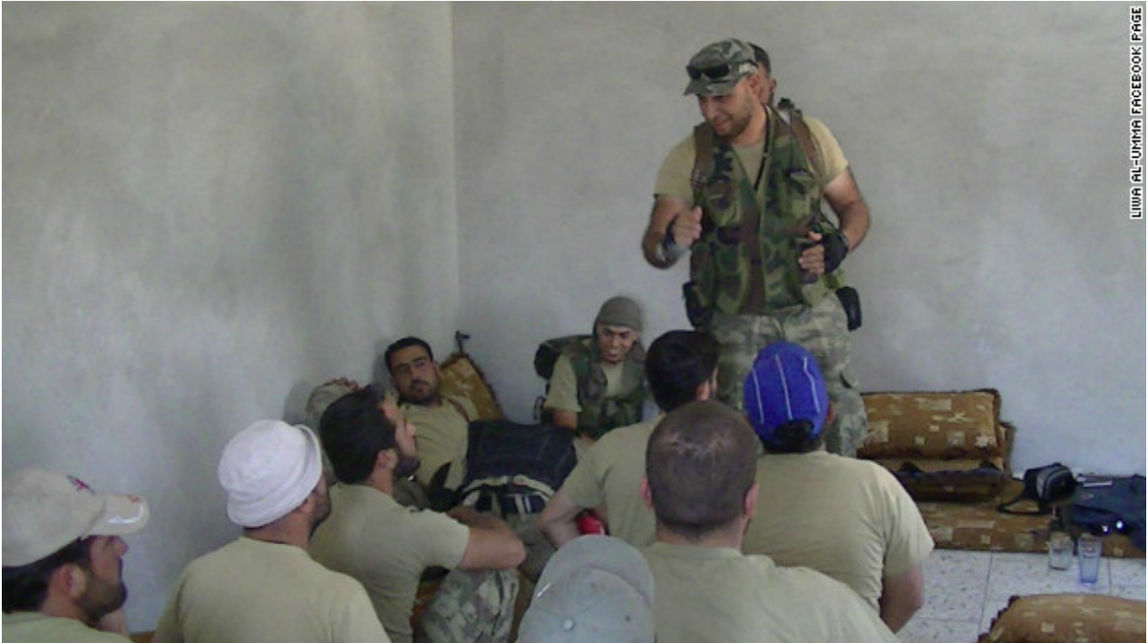
Image: Libyan Mahdi al-Harati of the US State Department , United Nations , and the UK Home Office (page 5, .pdf) -listed terrorist organization, the Libyan Islamic Fighting Group (LIFG), addressing fellow terrorists in Syria. Harati is now commanding a Libyan brigade operating inside of Syria attempting to destroy the Syrian government and subjugate the Syrian population. Traditionally, this is known as “foreign invasion.”