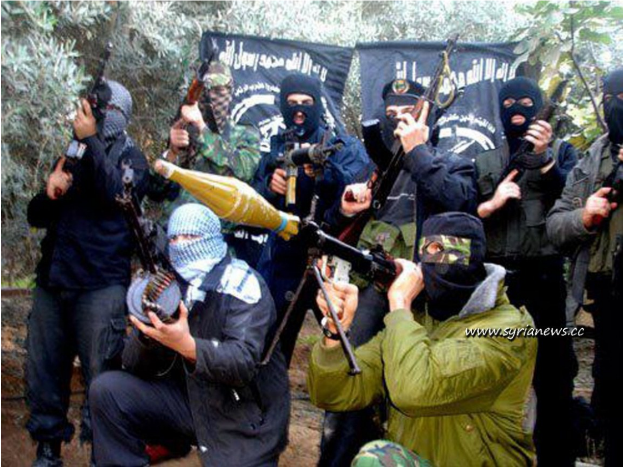
WESTERN DOUBLESPEAK: "Moderate Rebels" in Syria.

Despite now Washington's farcical legal evasion claiming how it is shipping arms into Syria in order to help the long-defunct, albeit aspirational construct, the 'Free Syrian Army,' in the supposed "fight against ISIS," bureaucrats can no longer hide their true intentions. It should also be noted that by arming internationally recognized terrorists fighters – Washington and any other allies involved in these illicit operations – are in direct violation of United States Anti-Terrorism laws, as well as similar European and international laws. However, because this has been a bipartisan effort from the beginning, co-steered by key Republicans including John McCain , Ed Royce , and Mike Rogers – no such indictments may ever be brought against Washington's criminal weapons traffickers. If such a case were ever prosecuted, then every US politician involved in this operation, both Democrat and Republican as well as agency officials, could, in theory, be charged with providing material support and lethal aid to known terrorist entities. Perhaps for this reason, the US and its allies have avoided specifically naming Al Nusra Front and its terror affiliates in most of the language in their official pronouncements of 'rebel' support.