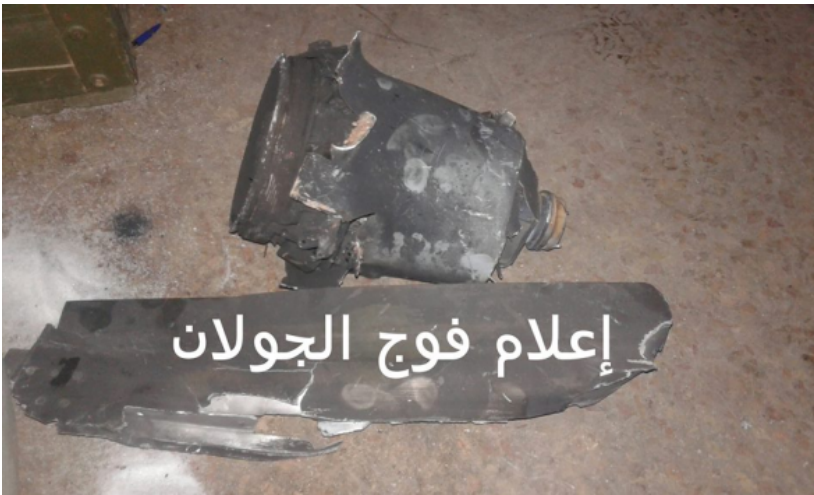
The remnants of an Israeli missile that hit SAA Golan regiment's tank.

The incident led to heavy losses of equipment and material in the Syrian Arab Army.