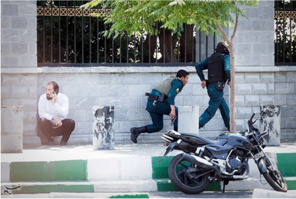
Members of Iranian forces run during an attack on the Iranian parliament in central Tehran

“I was inside the parliament when shooting happened. Everyone was shocked and scared. I saw two men shooting randomly,” said one journalist at the scene, who asked not to be named.