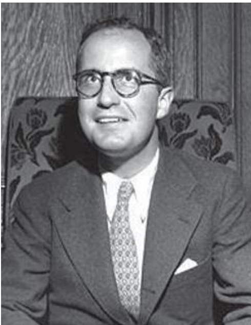
Kermit Roosevelt Jr.

Kermit Roosevelt and his co-conspirators had saved BP's (AIOC was renamed British Petroleum in 1954) wretched skin. In those three decades (1953-1979) BP became fully globalized, enhanced by its newly rediscovered El Dorado. Well could its stockholders enjoy their fabulous pickings. By market capitalization (1979) BP had become the world's fifth largest company.