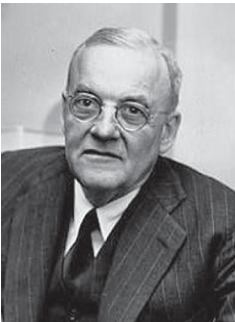
John Foster Dulles

The battle lines were becoming clearer. One of the biggest latifundistas (landowners) in Guatemala (and indeed in all of Central America) was the United Fruit Company headquartered in Boston. Its shares were owned by most members of Congress and the Senate, which vastly contributed to its political leverage. One of its major shareholders and political backers was John Foster Dulles (1888-1959), later Secretary of State in the Eisenhower administration that came to power in January 1953 - a year of pivotal importance, as we shall see, in the history of Iran. His brother Allen Dulles, who would play a paramount role in the butchering of Iranian democracy, became head of the Central Intelligence Agency (CIA). After the CIA-orchestrated eradication of the Arbenz administration in 1954, Allen Dulles became the chairman of the board of United Fruit. Indeed, the Dulles family had been among the largest stockholders of UFC since the 1920s.