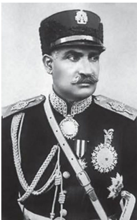
Reza Shah Pahlavi

A crucial date in Mossadeq's political trajectory (and that of APOC, which was renamed the Anglo-Iranian Oil Company (AIOC) in 1935) was the forced abdication in 1941 of Reza Shah Pahlavi, who was succeeded by his son Mohammed Reza Pahlavi. The date was of immense geopolitical significance. It coincided with the first massive Soviet offensive that pushed the Wehrmacht 200 km west of Moscow and the Japanese attack on Pearl Harbour. The anti-fascist coalition gave a new impetus to the resistance struggle. Oil was being marketed to the Soviet Union for the first time despite AIOC's stiff resistance. Tudeh's new strategy was to resist calls for precipitous nationalization. Its central goal was to extend its organizational power base throughout the country by mobilizing the industrial working class and the peasantry, and making deep recruitment inroads into the armed forces.