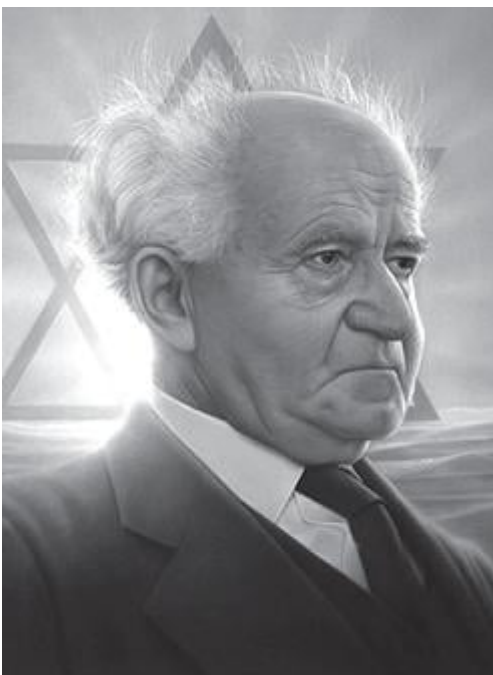
David Ben Gurion

Israeli premier David Ben Gurion ecstatically proclaimed that Israel would henceforth never cease to enjoy easy access to inexhaustible and cheap supplies of oil. The oil may have been cheaper but it was now drenched with the blood of the Iranian peasant/worker resistance. The joys of Ben Gurion stemmed not only from cheaper oil but also from other, political factors. As the historical record reveals, Mossadeq and Tudeh had vigorously articulated their hostility to the mass expulsion of Palestinians from their homeland and the savage colonial occupation that followed.