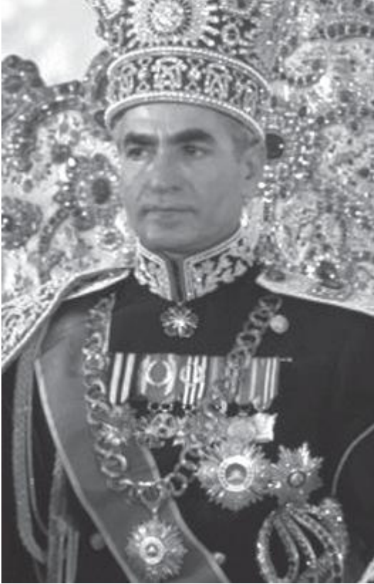
Mohammed Reza Pahlavi

This policy orientation moved in tandem with closer collaborative work with Mossadeq's National Front. This new turn was masterfully summarized in a proclamation by Tudeh's Central Committee. Couched in a language of moderation, it was nonetheless interpreted by the ruling class, AIOC and imperialism as signalling the liquidation of AIOC and the end of Britain's influence: