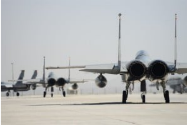
Image: F-15 Eagles from the 493rd Fighter Squadron at Royal Air Force Lakenheath, England, taxi to the runway during the final day of Anatolian Eagle June 18, 2015, at 3rd Main Jet Base, Turkey. The 493rd FS recently received the 2014 Raytheon Trophy as the U.S. Air Force's top fighter squadron.

-Three workers were killed and 12 wounded in an air strike on the former Pepsi bottling plant .