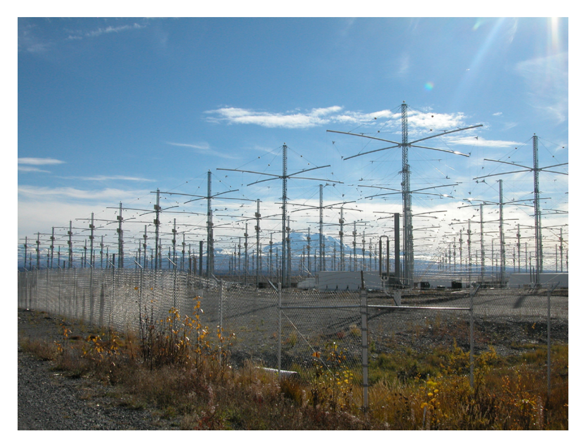
HAARP antenna array (Licensed under the Public Domain)