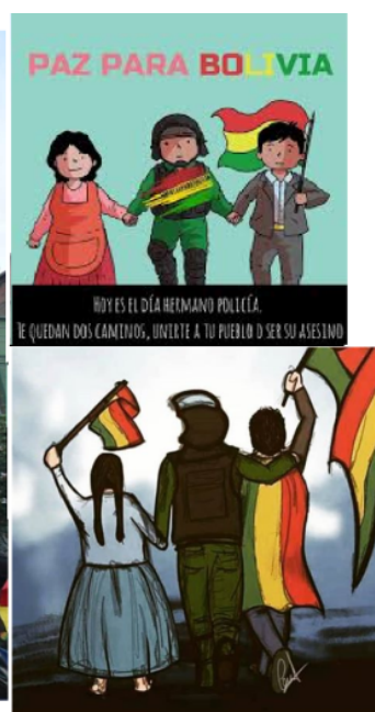
To the left, Cochabamba police riot greeted by civilians equipped with helmets, truncheons and artisanal rocket launchers. To the right, children’s illustrations broadcast on social networks by the Cruceña Youth Union, aimed at disguising violence.

In those moments, with the betrayal of the security forces, the destiny of plurinational Bolivia was at stake. It was the event that tipped the balance in favor of a coup strategy conceived as a set of combined forces. An opposition whose sole purpose was to sabotage democracy. Its objective? Allowing once again the plundering of national wealth and preventing the industrial development of Bolivia from its significant reserves of lithium. The