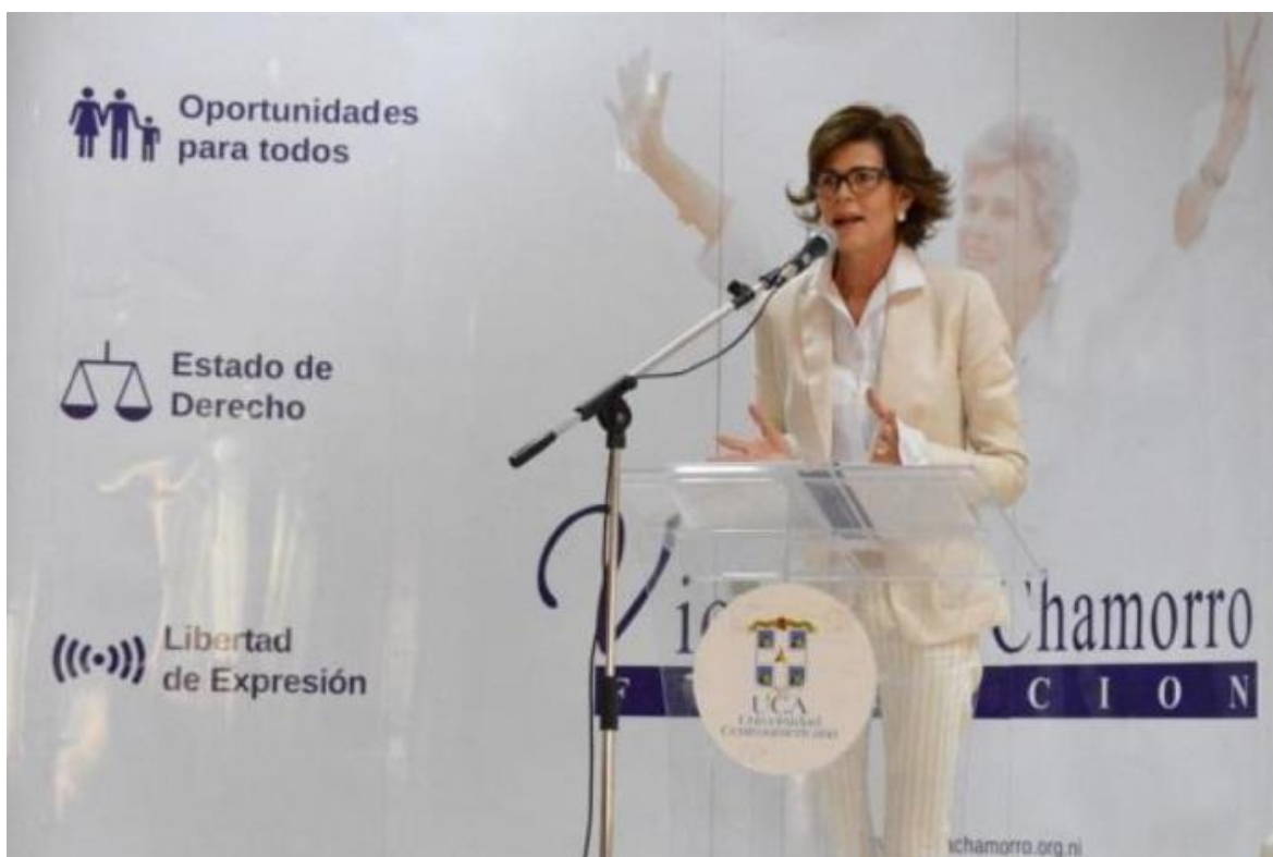
Violeta Chamorro speaks before foundation.