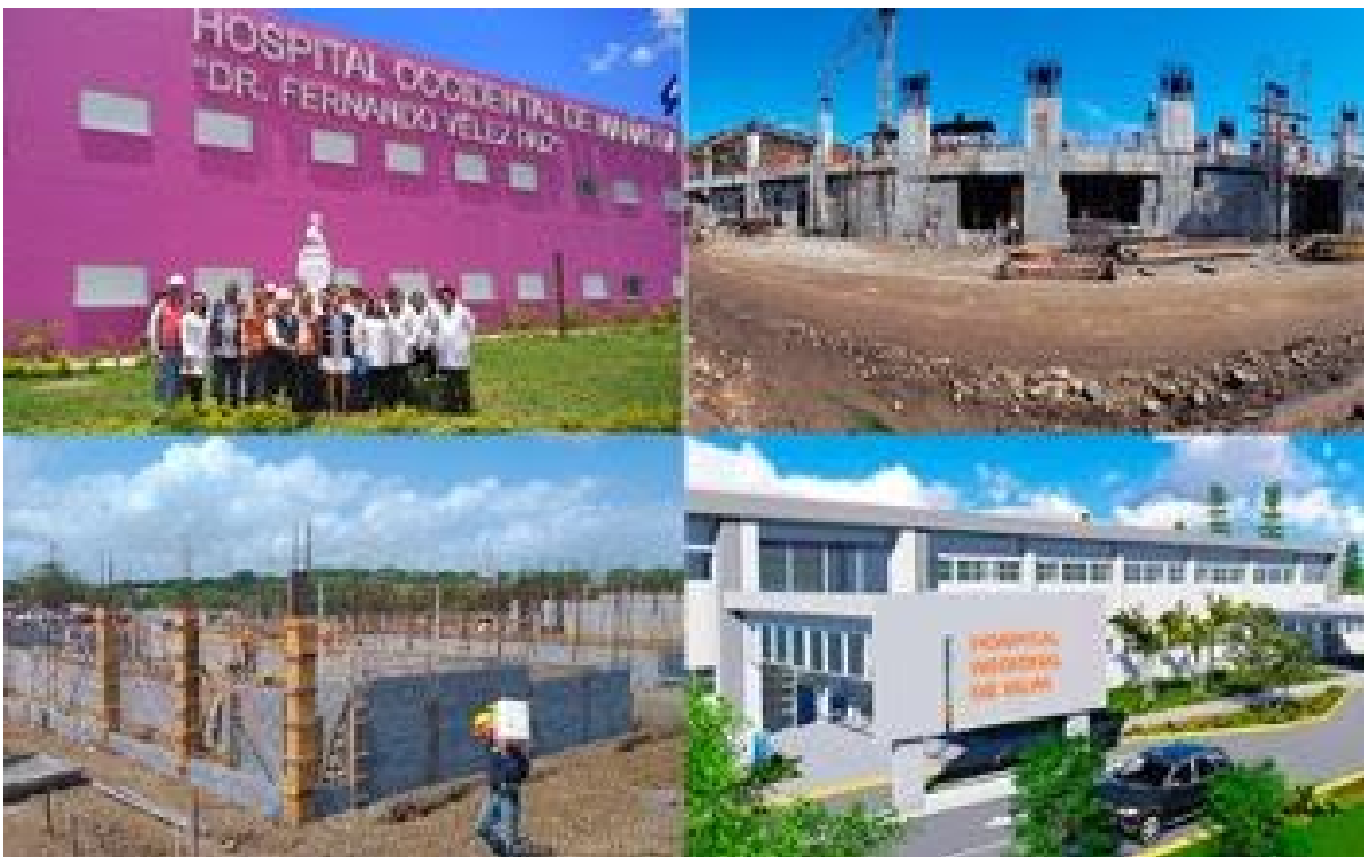
Photo of new hospitals built recently from Nicaragua Sandino.

The correction of this travesty of reporting from 60 Minutes requires a 60 Minutes team to actually come to Nicaragua to interview the people that live here whose lives have improved amazingly since 2007 with free universal education and health care; 99.2% of homes have electricity; about 90% have running water; the best roads in the region; housing programs; more than half a million people have received a registered title to their land. The primary goal of the Government of Reconciliation and National Unity is the elimination of poverty.