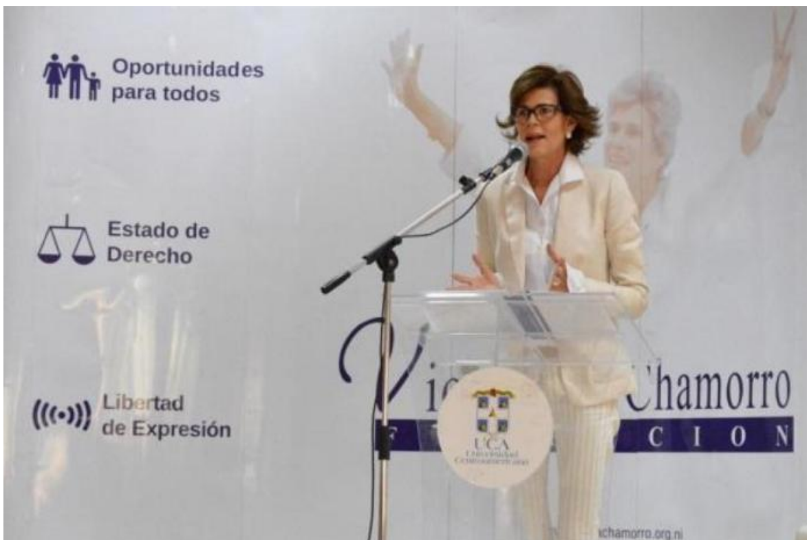
Violeta Chamorro speaks before foundation.