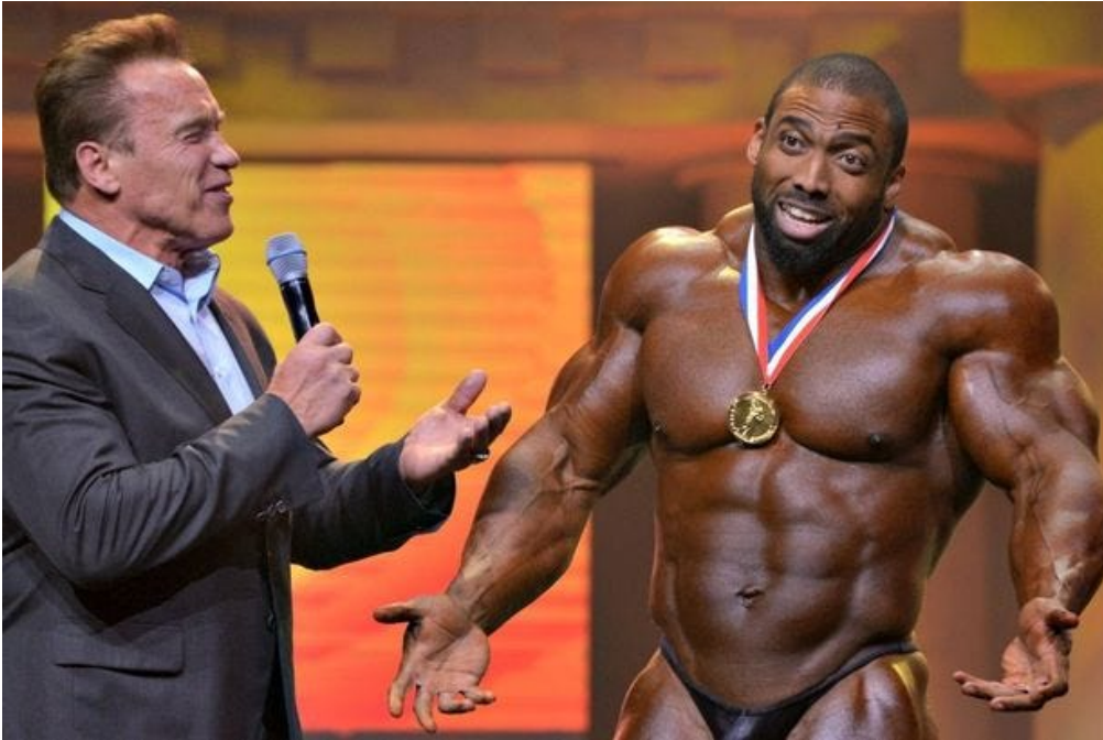
Bodybuilder Bostin Lloyd, age 29 died suddenly on Feb. 25, 2022 from an aortic dissection ( click here )