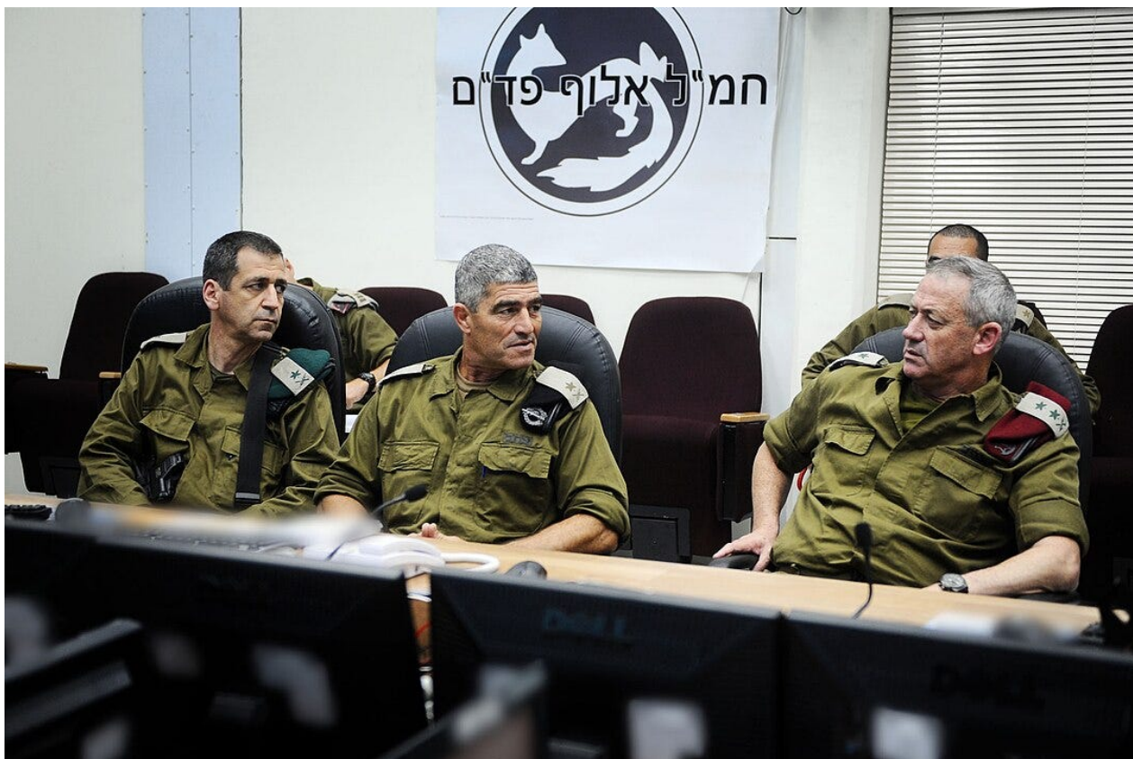
From right to left: Chief of Staff Benny Gantz, Commander of the Southern Command Tal Russo, and Chief of the Israeli Military Intelligence Directorate Aviv Kohavi.

Kohavi was also head of military intelligence himself when Benny Gantz was IDF Chief of Staff.