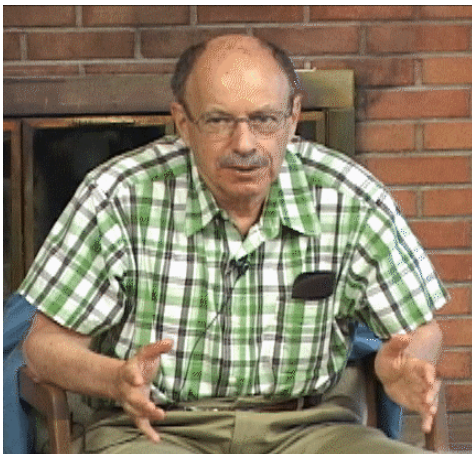
Professor James Petras

I want to argue from a different perspective, focusing on the increasing subdivision of markets, the deepening autonomy of political action from economic development, the greater threat of military interventions and increasing political accommodation. I believe that we will experience a radical making and remaking of political and economic integration, East and West , within and without nations states. 'States Rights' will re-emerge as an antidote to globalization. Big countries will compete in regional wars with limited commitments but with global goals.