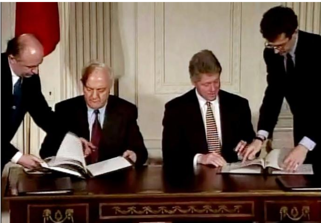
Eduard Shevardnadze and President Clinton sign a bilateral investment treaty at the White House in March 1994.

Some $302 million was provided to the Georgian government of Eduard Shevardnadze, who had come to power in a coup d'état backed by the Western powers which toppled nationalist Zviad Gamsakhurdia, who died under suspicious circumstances a year later. [9]