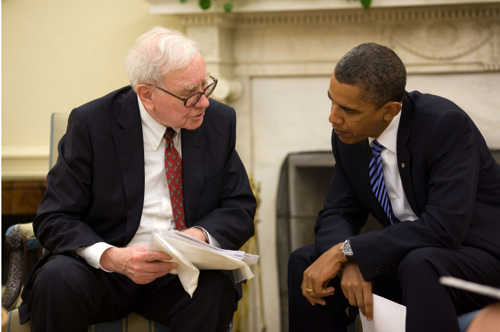
Warren Buffett (L), President Barack Obama (R)

BNSF serves as the Queen Bee in the oil-by-rail world. Owned by major Obama donor and one of richest men on the planet , Warren Buffett , BNSF has already held two meetings with OIRA in recent weeks .