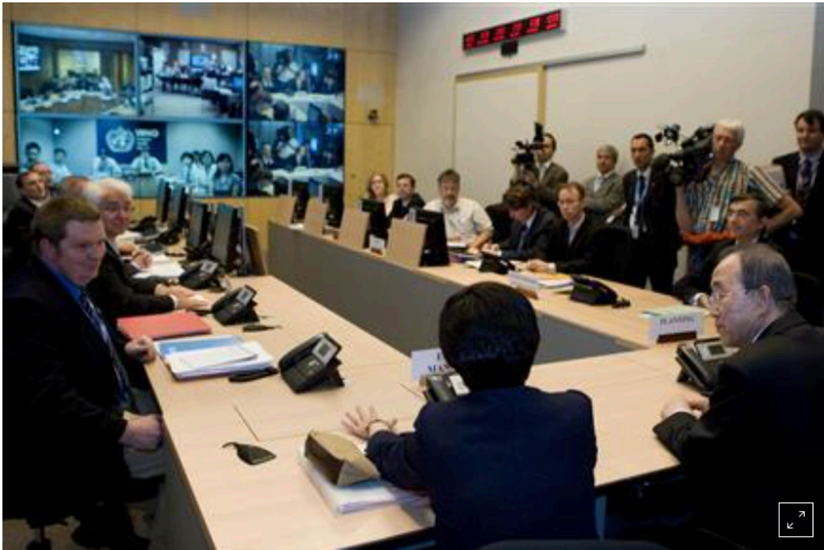
United Nations Secretary-General Ban Ki-moon (R) listens to WHO Director-General Margaret Chan (C) during a visit to the Strategic Health Operations Centre (SHOC) room at the World Health Organization (WHO) headquarters in Geneva, May 19, 2009.

GENEVA (Reuters) - Vaccine makers could produce 4.9 billion pandemic flu shots per year in the best-case scenario, the head of the World Health Organization said on Tuesday, as rich and poor countries grappled over limited supplies.