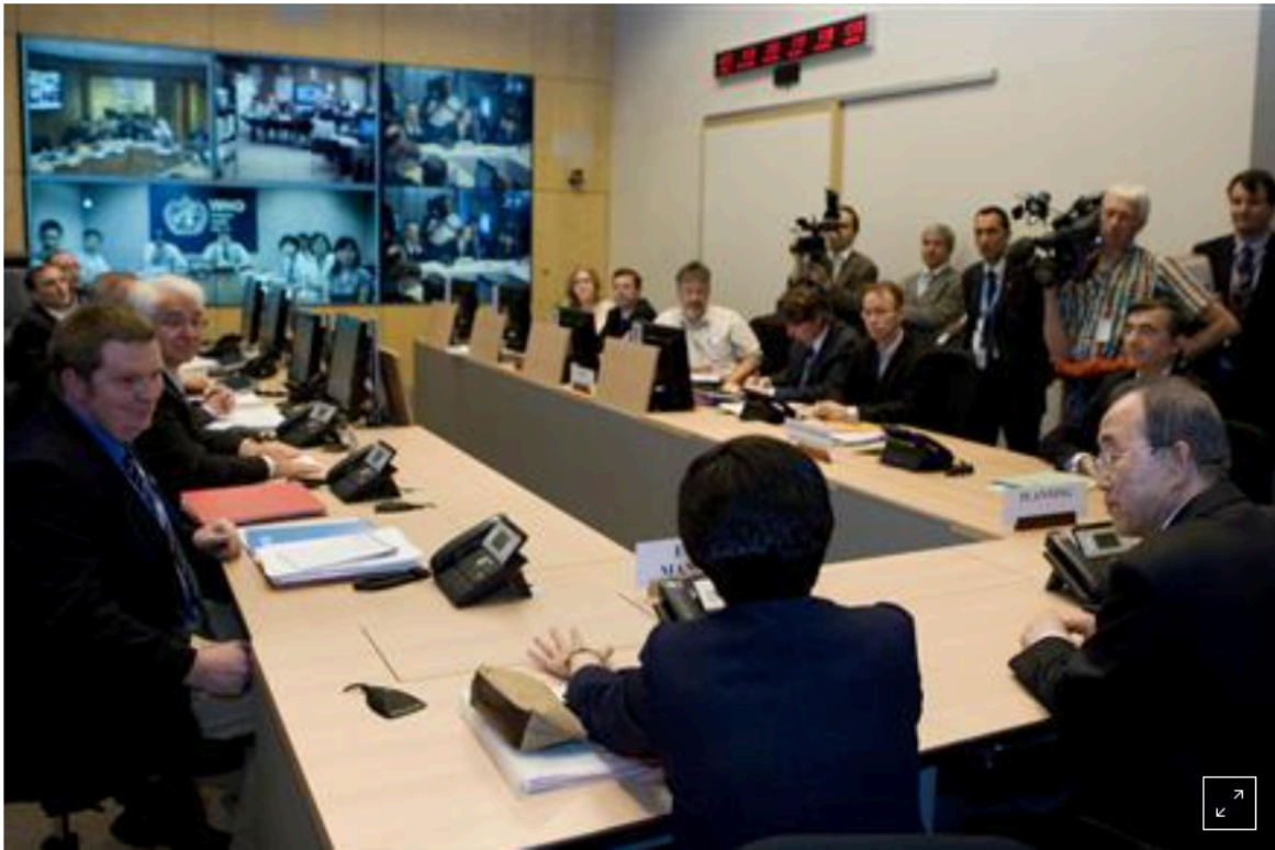
United Nations Secretary-General Ban Ki-moon (R) listens to WHO Director-General Margaret Chan (C) during a visit to the Strategic Health Operations Centre (SHOC) room at the World Health Organization (WHO) headquarters in Geneva, May 19, 2009.

GENEVA (Reuters) - Vaccine makers could produce 4.9 billion pandemic flu shots per year in the best-case scenario, the head of the World Health Organization said on Tuesday, as rich and poor countries grappled over limited supplies.