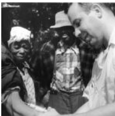
Image on the right: Tuskegee Syphilis Study 1932-1972

For more than 40 years, another case of immorality, unethical medical standards and neglect occurred in Macon County, Alabama with the Tuskegee Syphilis Study that began in 1932 and ended in 1972. The experiment was conducted by the U.S. Public Health Service (PHS) as a way to study the “natural progression” of syphilis with more than 600 sharecroppers which in this case, can be regarded as lab rats from the black community with at least 399 of them who had the syphilis infection and the remaining 201 who did not reportedly have the disease.