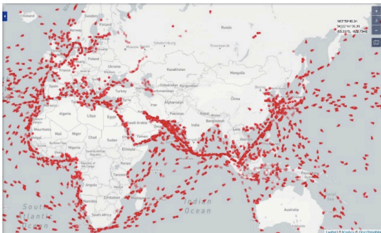
See this map of tankers on high sea, unable to unload

Natural gas futures in several European markets were negative. The first time in history. Of course, these are spot prices. They may fluctuate by the hour – but the sheer fact that they have fallen into the negative zone, indicates that energy shortages are manipulated.