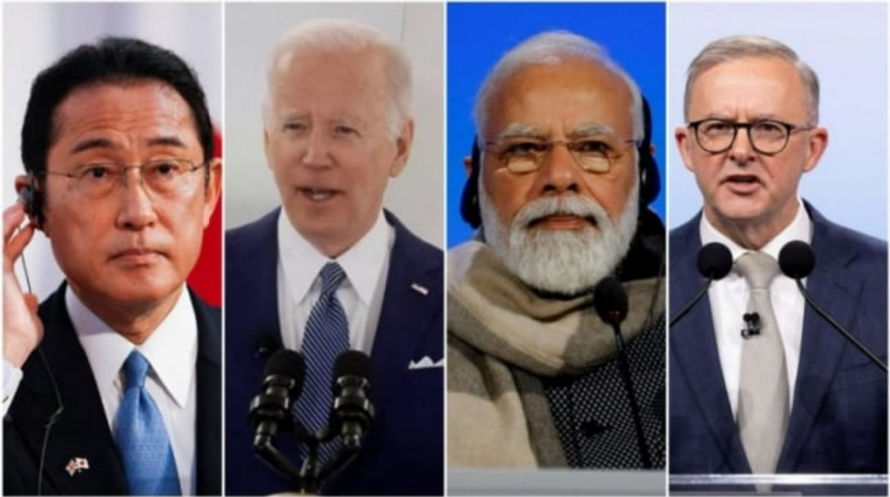
India PM Narendra Modi, US president Joe Biden, Japanese PM Fumio Kishida, Australian PM Anthony Albanese, Quad summit in Tokyo on May 24.

The effectiveness of Quad depends on how India would react in case of war with China. India belongs to several multinational organizations such as BRICS, SOC, RCEP where India maintains good relations with China.