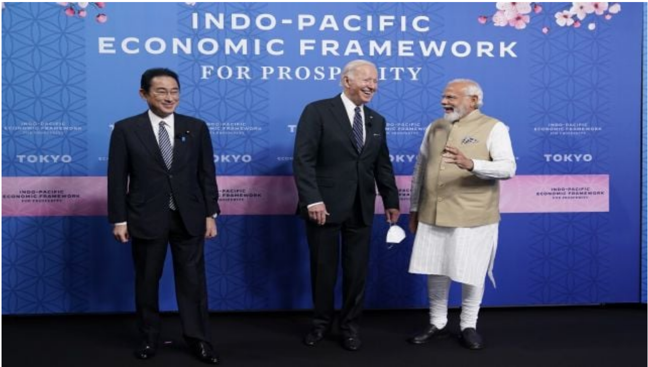
Japanese Prime Minister Fumio Kishida, left, President Joe Biden and Indian Prime Minister Narendra Modi, Indo-Pacific Economic Framework for Prosperity, May 23, 2022

The purpose of this new organization is to contain China. The IPEF gives itself four areas of regional cooperation including realignment of the production chain, renewable energy, trade and fight against corruption. However, the ultimate role is to contain China intensified by the restriction of exchanges of goods, ideas and services especially exchange of technology.