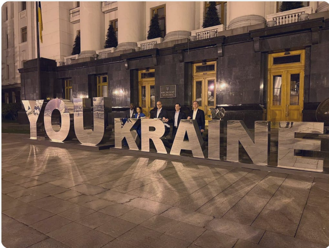
Nancy Pelosi and 4 others

The United States is in this to win it and we will stand with Ukraine until victory is won.