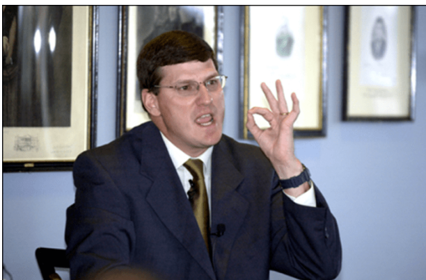
Image on the right: Scott Ritter giving a lecture at the Harvard Kennedy school pointing to the lack of evidence for WMDs. He was a key figure excluded from the hearing.