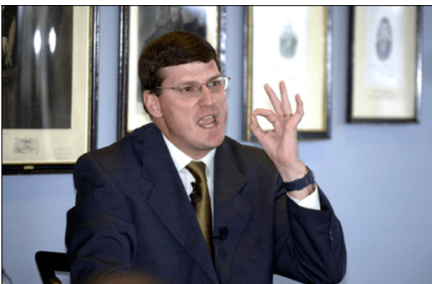
Image on the right: Scott Ritter giving a lecture at the Harvard Kennedy school pointing to the lack of evidence for WMDs. He was a key figure excluded from the hearing.