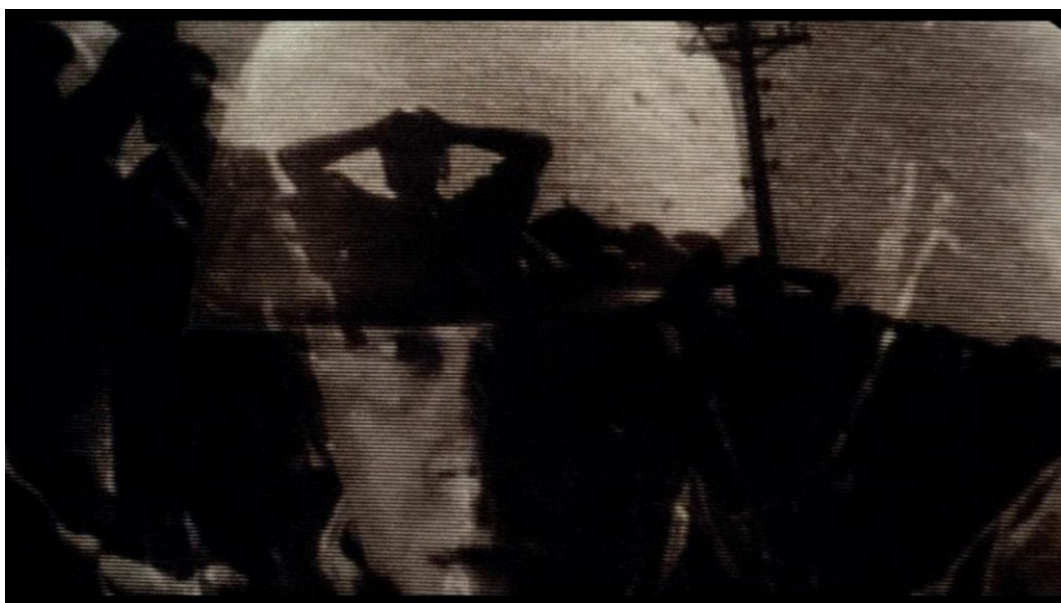
Nineteen Eighty-Four (1984) screenshot

Thus the media dome controls every factor of the peoples lives, from what to think, what to buy, and who to go to war with.