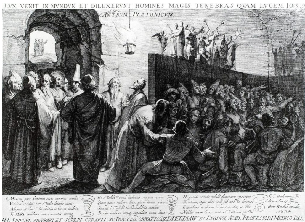
Plato’s allegory of the cave by Jan Saenredam, according to Cornelis van Haarlem, 1604, Albertina, Vienna

prisoners is a fire, and between the fire and the prisoners is a raised walkway with a low wall, behind which people walk carrying objects or puppets of men and other living things. The prisoners cannot see any of what is happening behind them, they are only able to see the shadows cast upon the cave wall in front of them. These shadows are reality for the prisoners because they have never seen anything else. Plato then discusses the freedom of one prisoner. He writes : “the freed prisoner would turn away and run back to what he is accustomed to (that is, the shadows of the carried objects), he would escape by turning away to the things which he was able to look at, and these he would believe to be clearer than what was being shown to him.”