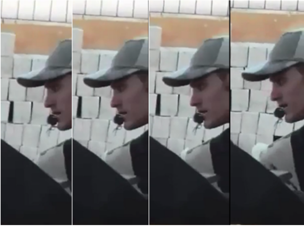
Militarily attired male with microphone headset (See https://bbcpanoramasavingsyriaschildren.wordpress.com/#european )