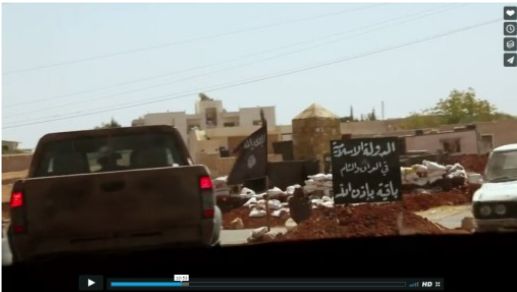
Ian Pannell and Darren Conway’s convoy approaches an ISIS checkpoint in Saving Syria’s Children

Stanford University’s Mapping Militants Project states that “Ahrar al-Sham worked with the Islamic State (IS) until January 2014”. The partnership would seem to be amply borne out by the scenes of Pannell and Conway’s entourage passing unmolested through an ISIS checkpoint at 11:00 in the programme. [5]