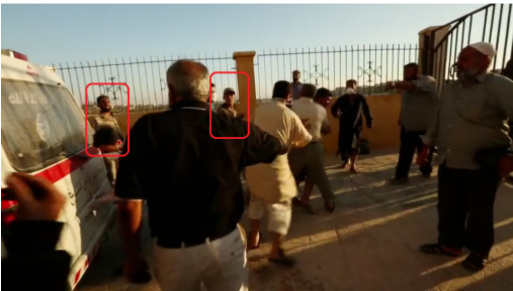
Two militants who transported a female alleged incendiary attack victim to Atareb Hospital. (See https://bbcpanoramasavingsyriaschildren.wordpress.com/#black-dress )