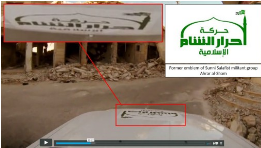
White pickup truck in convoy transporting BBC reporter Ian Pannell and cameraman Darren Conway on 26 August 2013 bears the former logo of Salafist militant group Ahrar al-Sham (Saving Syria’s Children, BBC1, broadcast 30 September 2013)

Stanford University’s Mapping Militants Project states that “Ahrar al-Sham worked with the Islamic State (IS) until January 2014”. The partnership would seem to be amply borne out by the scenes of Pannell and Conway’s entourage passing unmolested through an ISIS checkpoint at 11:00 in the programme. [5]