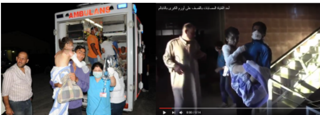
Unidentified girl featured in non-BBC footage from Atareb Hospital, Aleppo, 26/8/13 http://bit.ly/2kgtQOU (briefly discussed in the notes here http://bit.ly/1EUkgYv )