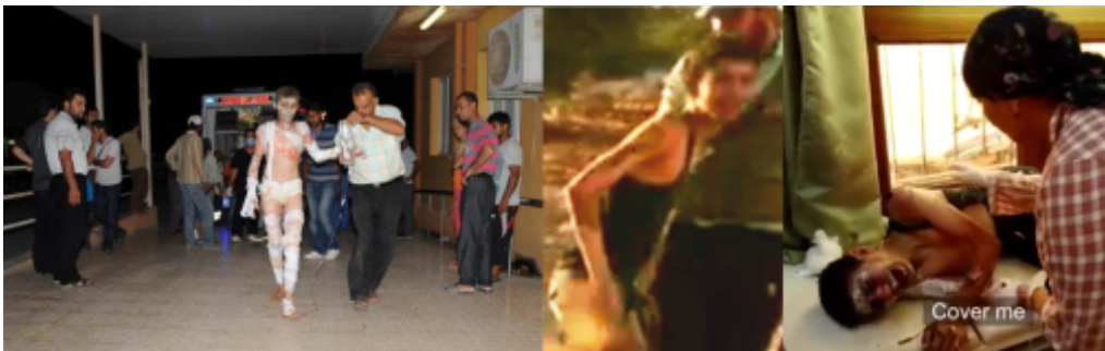
Unidentified adolescent male who appears to be grinning broadly in the BBC's footage http://bit.ly/1zXC16Y