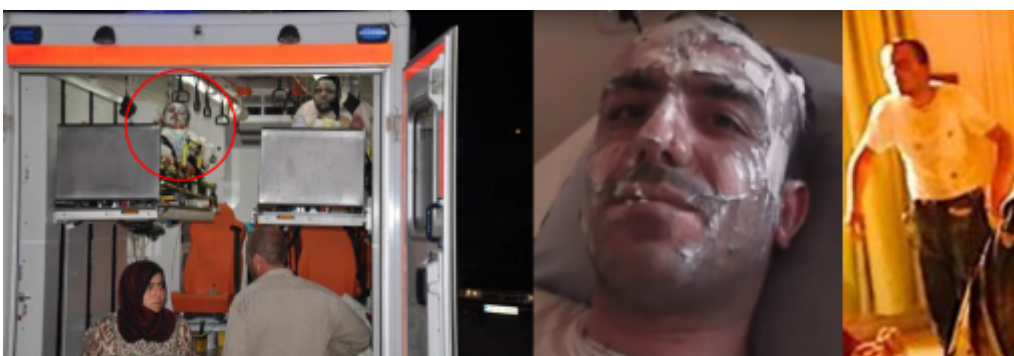
Possibly the supposed teacher who appears in Saving Syria's Children, swaying and lurching bizarrely, and in associated non-BBC footage http://bit.ly/1FcaK3Q