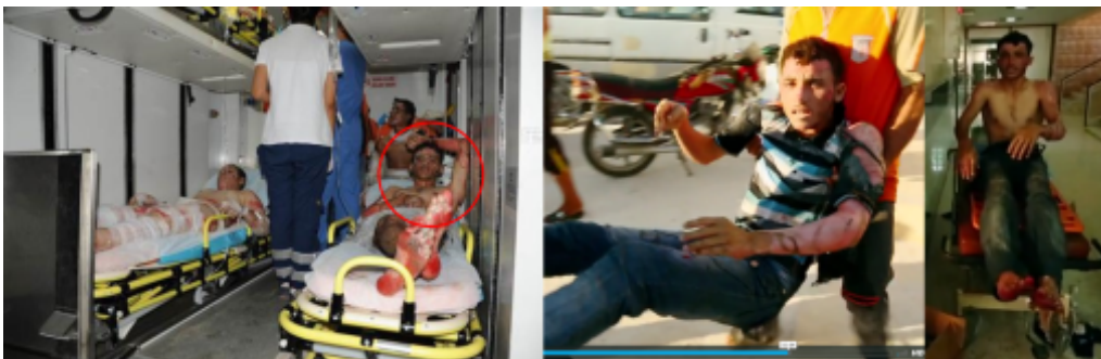
Unidentified male who appears at various points in Saving Syria's Children