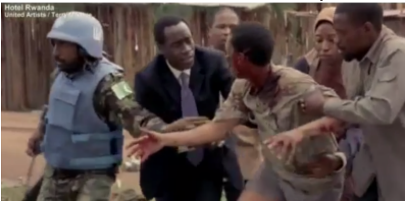
Image: Most of the world knows the Rwandan Genocide as the story told in the Hollywood film Hotel Rwanda. The new BBC documentary tells a radically different story.