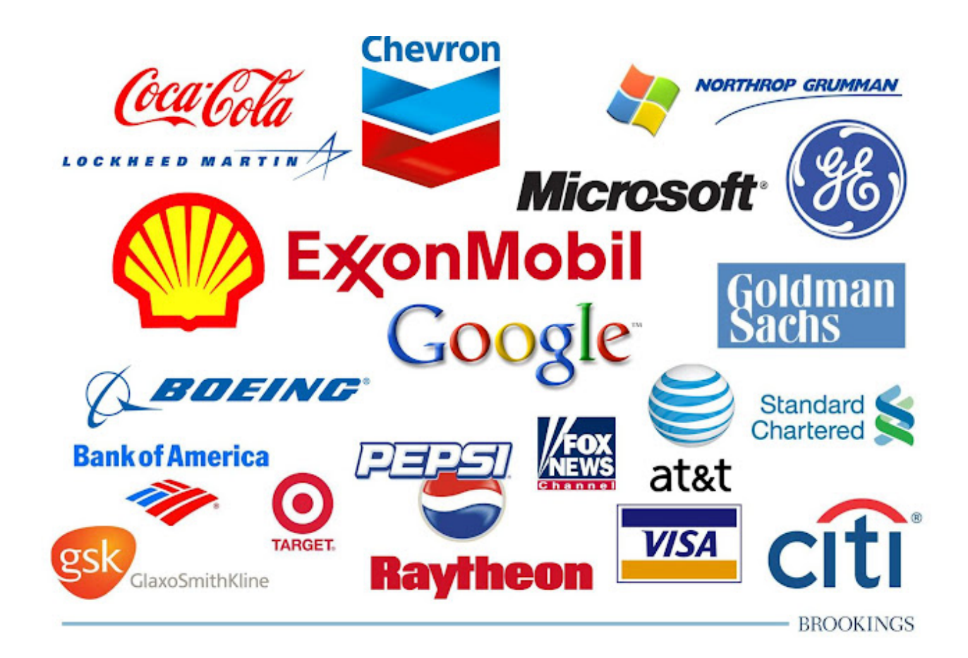
Image : Brookings Institution's corporate backers – clearly nothing to do with left-leaning liberal a