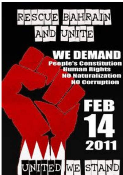
Image: From the beginning, the uprising in Bahrain bore all the markings of the US-engineered “Arab Spring” sweeping the Arab World. Even the CIA-funded “Otpor-fist” would find its way into Bahrain’s protests.....

It is quite clear then that Saudi and Qatari support for the US-engineered “Arab Spring” is born not out of altruism or fellowship, but out of fear for their own survival, with unrest already being triggered and encouraged by the West in at least Saudi Arabia, and with Bahrain resigned to a slow burn, briefly fanned by the West at junctures such as these, where a great amount of support is required against Syria to overcome recent setbacks. It is difficult to sympathize with either Qatar or Saudi Arabia, who have committed as much in the betrayal of their neighbors on behalf of Wall Street and London as they have against their own people. One wonders if amidst their spectacular betrayal of their Arab brothers, whether or not they realize they are next when Syria and Iran falls.