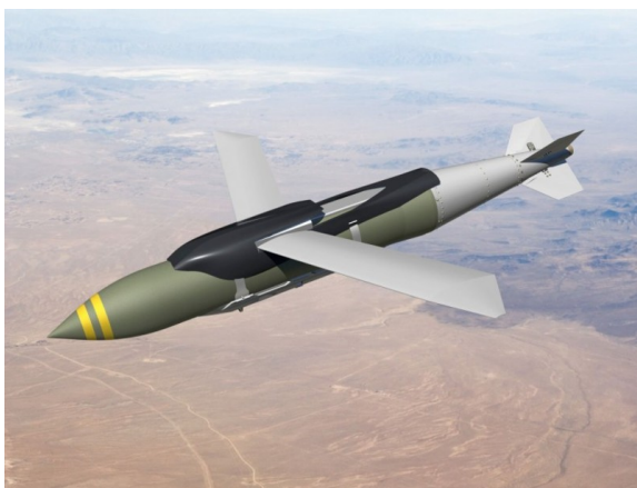
GBU-54 Laser Joint Direct Attack Munition (JDAM)

Hardened targets would have been attacked with 500 pound bombs known as AGM-154C Joint Standoff Weapons (JSOWs) costing $700,000 a piece from Raytheon (even though the principal design objective of these weapons is to enable high altitude release far from the danger of radar-guided ground to air missiles). When launched from high altitude these bombs glide more than 130 kilometers to their targets, guided by a combination of GPS coordinates and laser designation, with multiple warheads that can be set to detonate sequentially to allow the main warhead to penetrate hardened structures. 20 The cheaper ($25,000) option the Super Hornets based at Al Minhad are equipped with is the GBU-54 Laser Joint Direct Attack Munition (JDAM) made by Boeing . 21