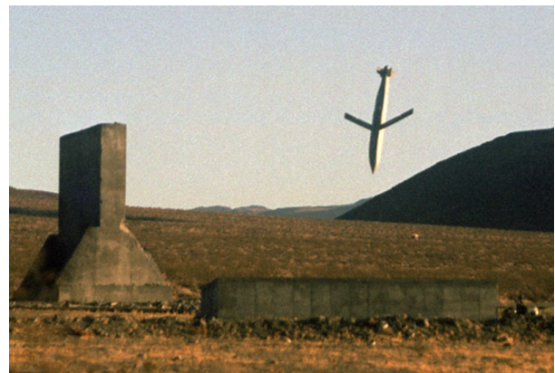
Raytheon - JSOW

In the first month of Australian air operations in Iraq, the six F/A-18F Super Hornets conducted 89 sorties, dropping 27 laser or GPS guided 500-pound bombs on 14 targets, 11 of which were confirmed destroyed, and the rest damaged. 18 In the first three weeks of November, Australian aircraft went on to release weapons on 20 occasions, including as part of a multinational strike with 20 aircraft attacking 44 targets, coordinating with a large scale Kurdish military force that the Australian commander said resulted in over 100 ISIL fighters killed. Australian forces took 'a command role', leading and planning in a major multinational coalition attack on a bomb factory in a densely populated part of the city of Mosul. 19