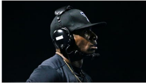
Trinity Christian-Cedar Hill offensive coordinator and retired professional football player Deion Sanders watches a play during a high school football game between Parish Episcopal and Trinity Christian-Cedar Hill on Thursday, Sept. 5, 2019 in Dallas.

Sanders also said that he has been vaccinated for "quite a long time."