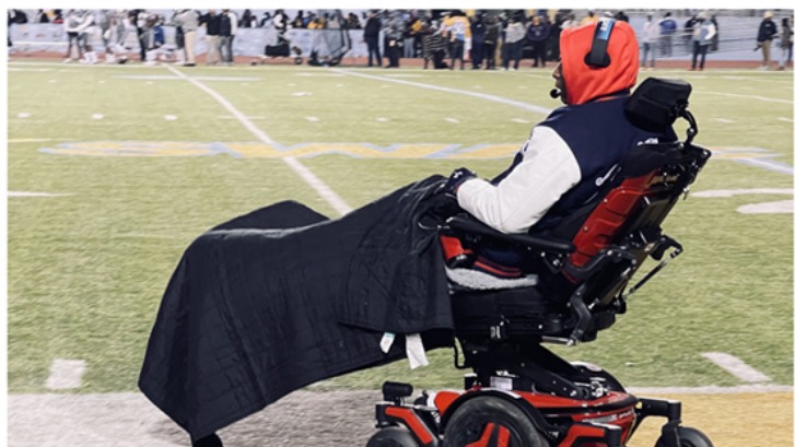
Jackson State's Deion Sanders coaches from the sideline in a game played against Southern University on Nov. 13, 2021.

A day before the Cricket Celebration Bowl in December, Jackson State football coach Deion Sanders rolled up his left pant leg, revealing a skin graft about 6 inches long and 3 inches wide on each side of his leg.