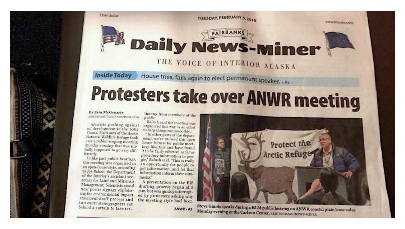
Front-page article on the Arctic Refuge Public Hearing in Fairbanks, Fairbanks Daily News-Miner , February 5, 2019.

When the BLM <u>announced</u> its plans on January 30, 2019, the agency failed to respond to the requests from the coalition and instead offered a much shorter extension until March 13. The BLM also announced only one public hearing outside of Alaska—again, as during the scoping phase, in Washington, DC. But this second round of hearings was structured on an even more compressed timescale to invite even less public input. The BLM stipulated that all public hearings be finished within a much shorter window of time—starting on February 4 and ending on February 13—and that the first hearing would happen just two business days after the announcement, not the two-week notice requested by the coalition. These decisions underscore the Trump administration's rampant and repeated efforts to stifle public participation in the process.