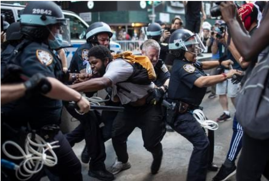
New York City police attack anti-racist demonstrators

Despite the declaration of a curfew thousands remained in the streets of New York City. In areas such as Manhattan, widespread property destruction and the seizure of consumer goods was the order of the night. The same situation prevailed in California where from Los Angeles to Oakland the unrest was not subsiding.