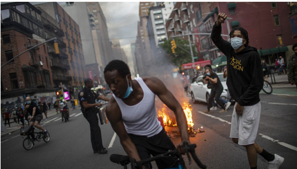
New York City demonstrations against police brutality and the murder of George Floyd

Just 45 minutes after the curfew went into effect on May 31, riot police charged the youth-dominated crowd gathered outside police headquarters on Third Street downtown. The police used teargas, pepper spray, pellets and rubber bullets. There were unjustified arrests while several participants along with journalists were hit by the gas and rubber bullets. Several journalists were detained after they had identified themselves as media workers. (See this )