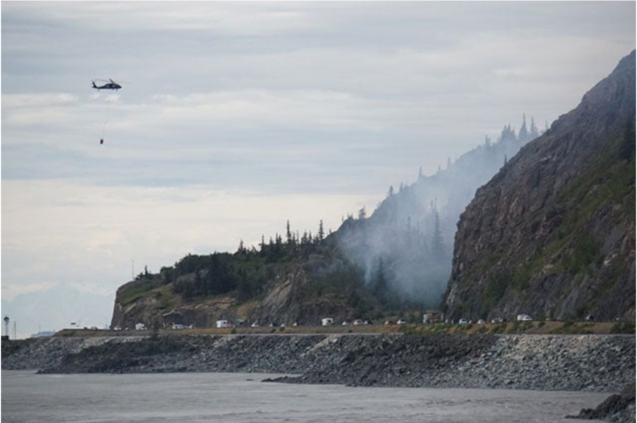
Image: Helicopters ferry water to drop on a wildfire just south of Anchorage, Alaska.

I recently spoke with several young Alaskans from the Aleutian Island of Unalaska, and their worry, anger and fear about what they are witnessing did not take long to surface.