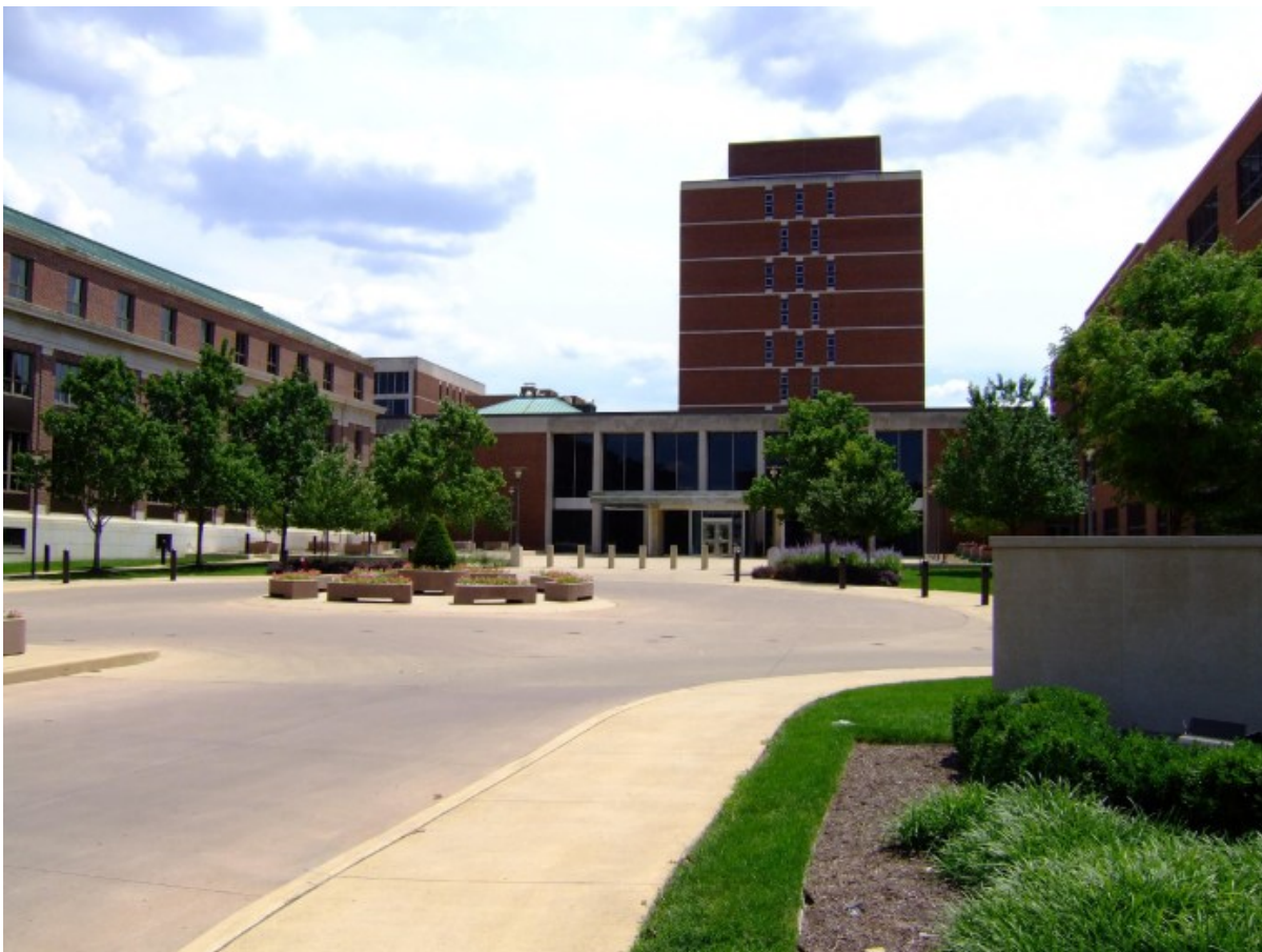
Batelle Memorial Institute.

There have been several developments since my book was written, two of which are especially important.