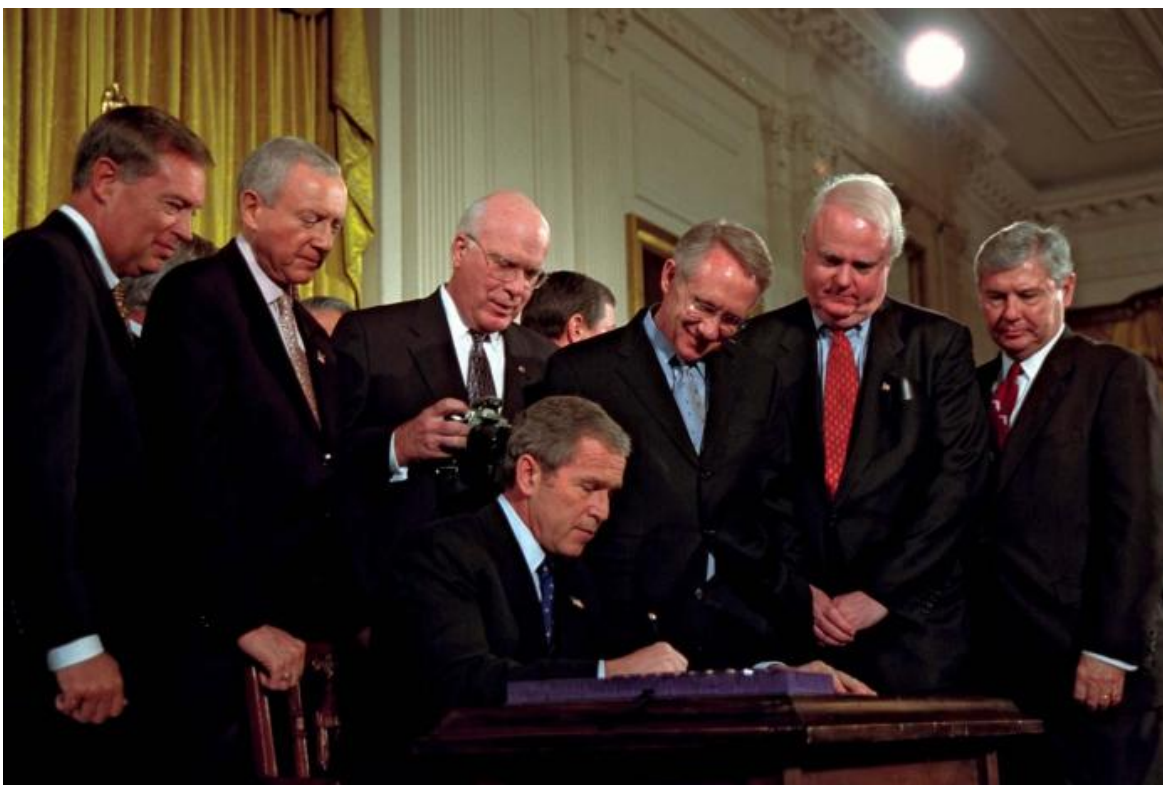
George W. Bush signs the USA PATRIOT Act

The attacks on Congress were, of course, successful. Congress was disciplined and meekly passed the Act.