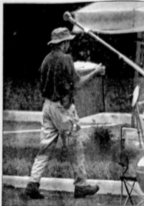
An unidentified federal investigator carries a box to his car Sunday at the American Media Inc. building in Boca Raton, Fla., where a number of employees tested positive for anthrax. One man from the company died of the disease.

A spokesman for American Media Inc., which publishes the sex-and-scandal supermarket tabloids National Enquirer , Star , Globe and others, said five additional employees had tested positive for exposure, bringing to eight the total affected in Florida.