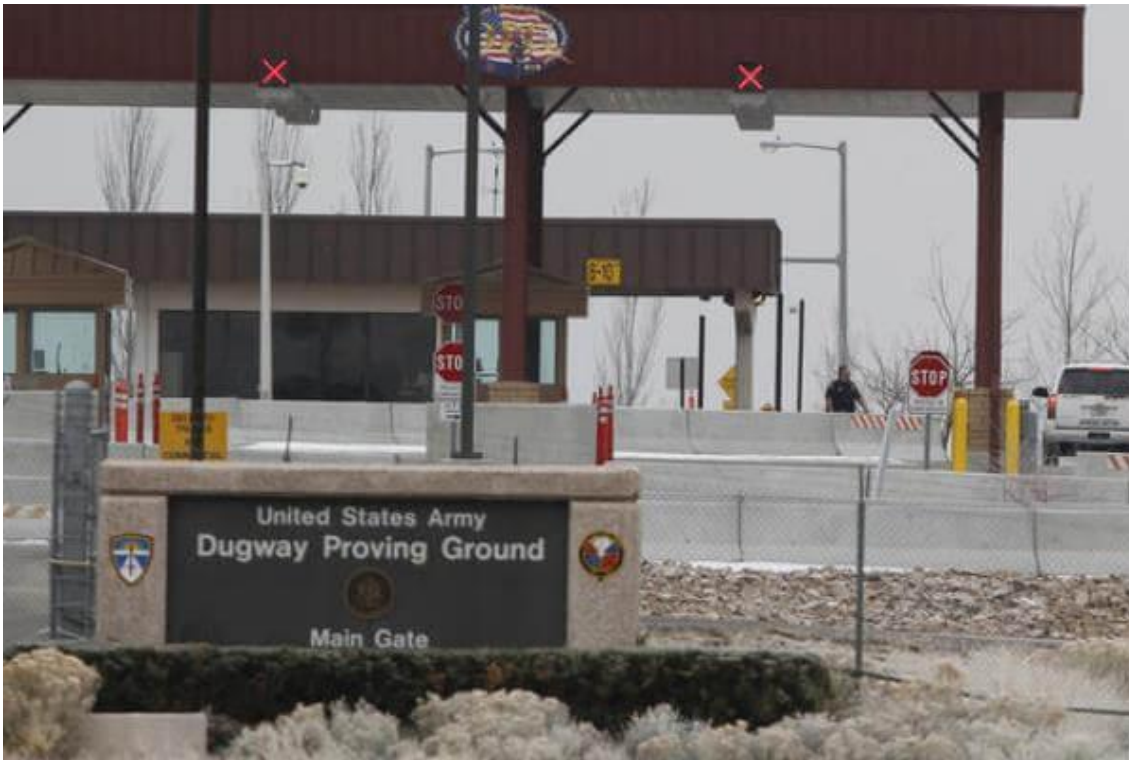
Dugway Proving Ground.