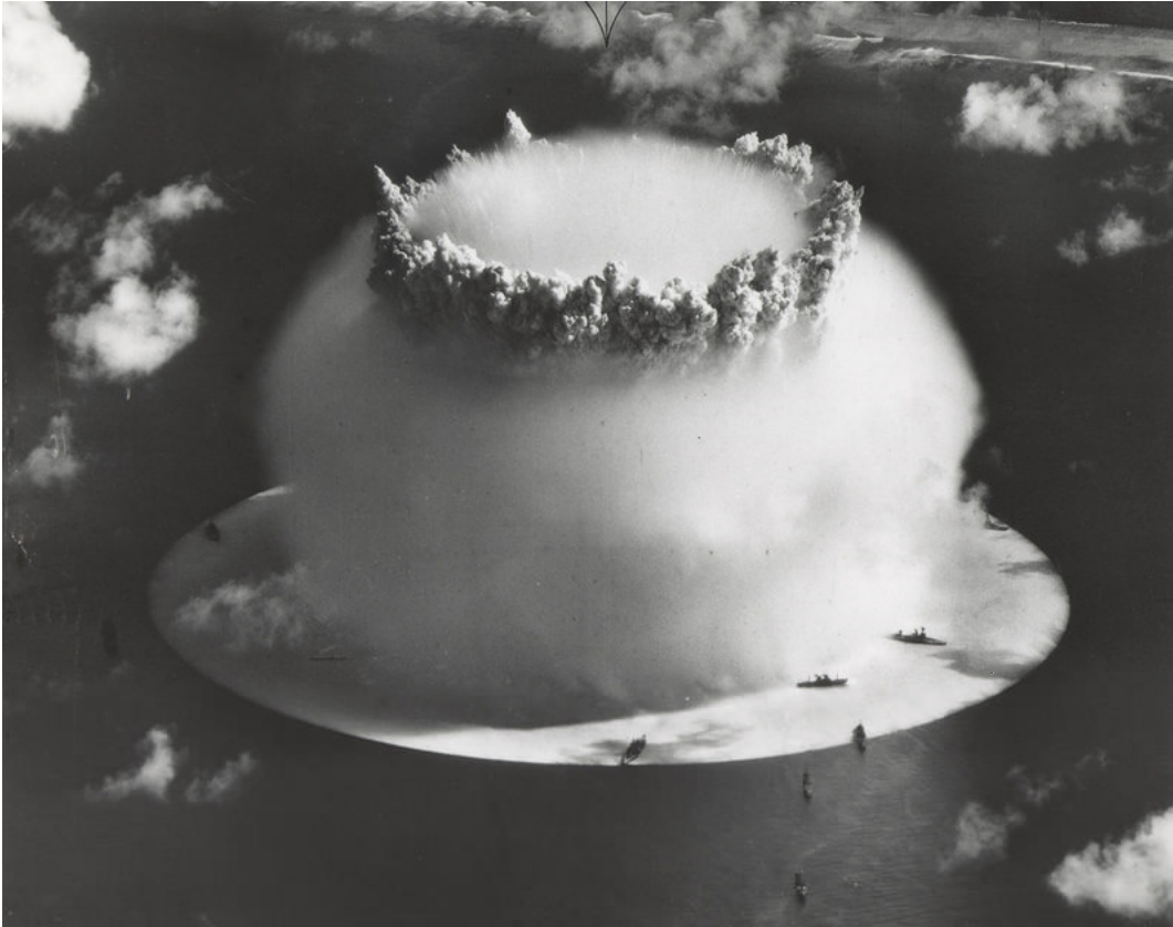
The Wilson cloud from test Baker, situated just offshore from Bikini Island at top of the picture.