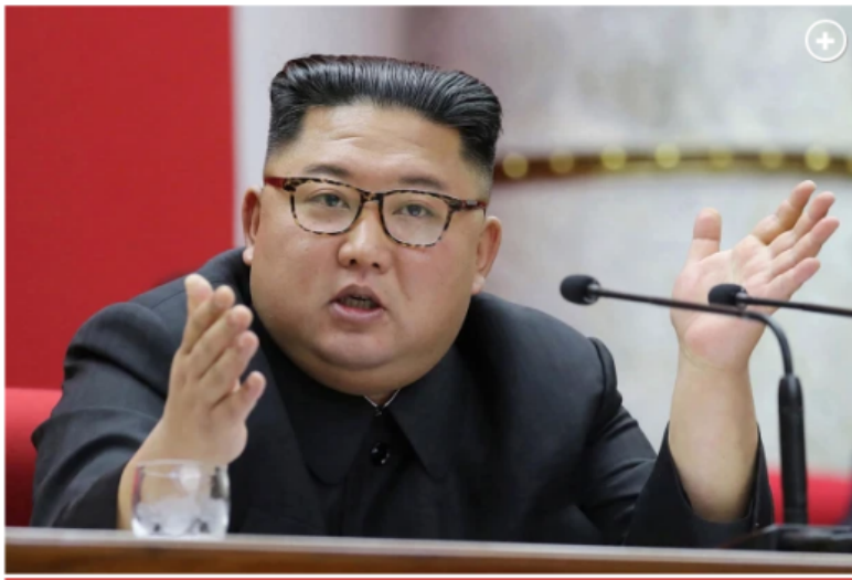
Kim Jong Un