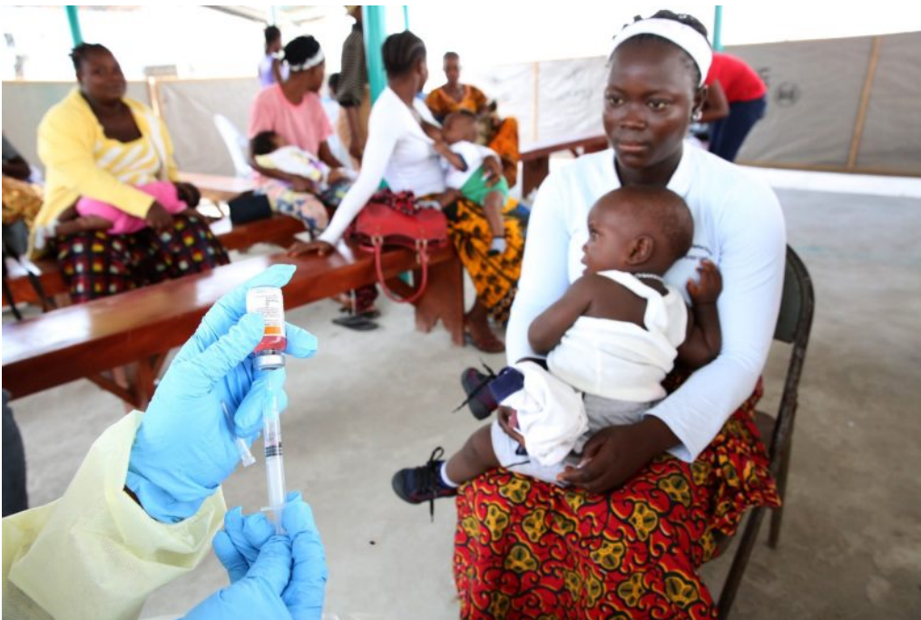
"Nurse prepares to vaccinate children"

Another especially worrisome factor is that pharmaceutical companies are conducting an ever-increasing number of clinical trials in third-world countries , where people may be less educated, and there are also far fewer safety regulations. Pfizer's 1996 experimental trials with Trovan on Nigerian children with meningitis — without informed consent — is just one nauseating example. When a former medical director in Pfizer's central research division warned the company both before and after the study that their methods in this trial were "improper and unsafe," he was promptly fired. Families of the Nigerian children who died or were left blind, brain damaged, or paralyzed after the study sued Pfizer , and the company ultimately settled out of court . In 1998, the FDA approved Trovan only for adults. The drug was later banned from European markets due to reports of fatal liver disease and restricted to strictly emergency care in the U.S. Pfizer still denies any wrongdoing.