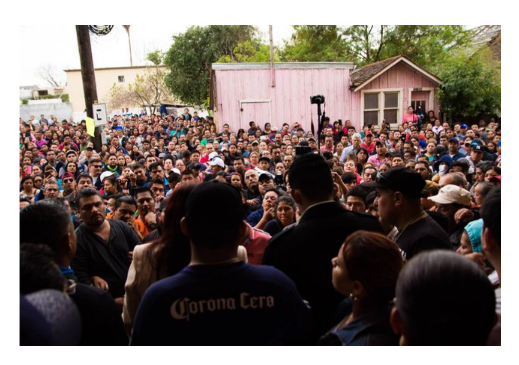
Workers confront the union leader outside of the headquarters on Thursday

The strike could very soon disrupt global supply chains in the United States, Canada and Asia. Industry experts estimate that the strike has already cost the maquiladora industry $20 million, or $23,000 per minute. The strike is affecting major suppliers to the "Big Three" automakers—GM, Ford and Fiat-Chrysler—as well as other manufacturers. Factories that are on strike include Autoliv, Inteva, Starkey, Edemsa, Aipsa, Cepillos, STC, Polytech, Kemet, Tyco, Parker and AFX.