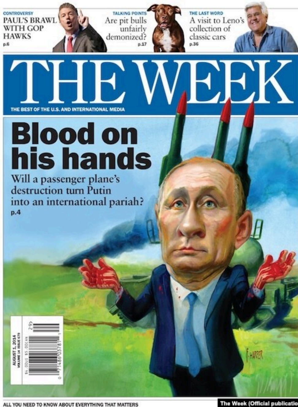
8. The August 1 U.S. edition of the British news magazine “The Week” shows Putin with “blood on his hands” in front of the Buk surface-to-air missile launcher, which has been blamed for the MH17 downing.