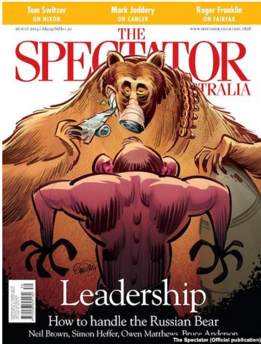
11. Australia's "The Spectator," dated July 26, pictures Russia as an armed bear gobbling up an airplane. Pin it